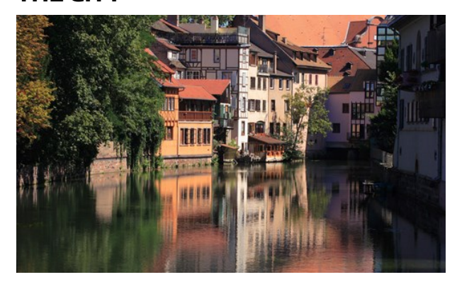
Netfalls

From the earliest centuries AD, Strasbourg has always been considered an important crossroads of Europe. In the fifth century, Franks already gave it the name of Strateburgum, "the road's fortified place." So, it's not by chance that the European parliament – a symbol of the town's cosmopolitan spirit – was built here, very close to the Rhine and the German border. The special atmosphere is also discernible in the architecture of the houses and churches, and is audible in the Alsatian dialect, which is a mixture of French and German.