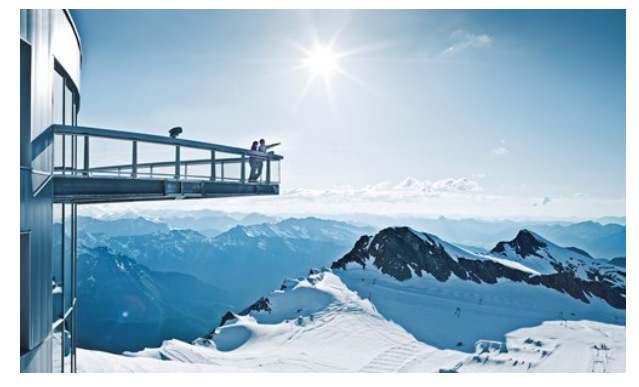
Gletscherbahnen Kaprun AG

Glaciers, mountains and lake – the Austrian town of Zell am See-Kaprun combines all aspects of the Alps and is a place to visit all year round. These include the summit world 3,000 on the Kitzsteinhorn, the unique glacier ski r area, the Maiskogel family region, the Schmittenhöhe local mountain, the crystal clear Lake Zell.Tradition and authenticity are reflected in the events and culinary specialties in the region. Guests can find relaxation in the 20,000 square metre water and wellness world in the Tauern Spa and in many other traditional pampering hotels.