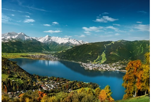
Zell am See-Kaprun Tourismus