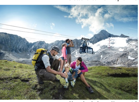
Gletscherbahnen Kaprun AG