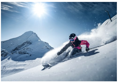
Gletscherbahnen Kaprun AG

Glacier, mountains and the lake - The region of alpine sights Zell am See-Kaprun