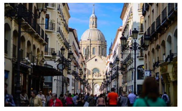
Pedro Etura/ Zaragoza Turismo

If you are stopping over in Zaragoza, make sure not to miss these 5 key sights.