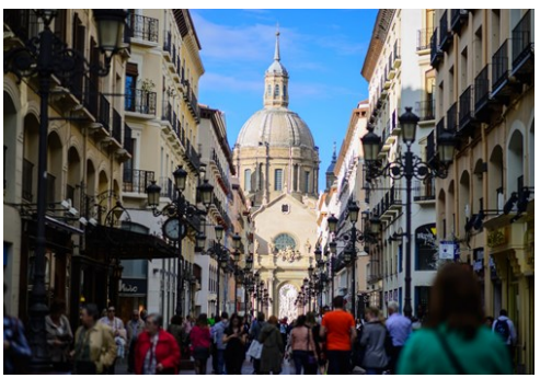
Pedro Etura/ Zaragoza Turismo

Zaragoza, the capital of Aragon, has a privileged location, equally distanced from Madrid, Barcelona, Valencia and Bilbao. The city is connected by an international airport and high-Speed line (AVE). Visitors can expect a delicious gastronomy and a rich heritage of historical monuments (Basilica del Pilar, Cathedral of San Salvador, Aljafería Palace, the paintings of Goya or the Mudejar-UNESCO Heritage of Mankind).