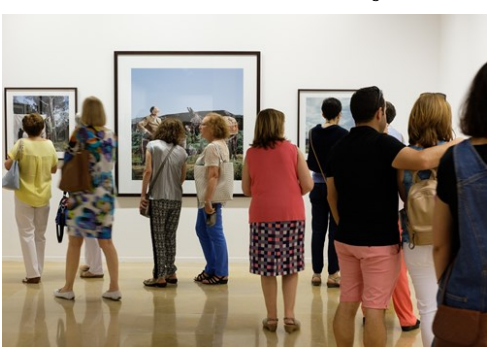
Pedro Etura / Zaragoza Turismo