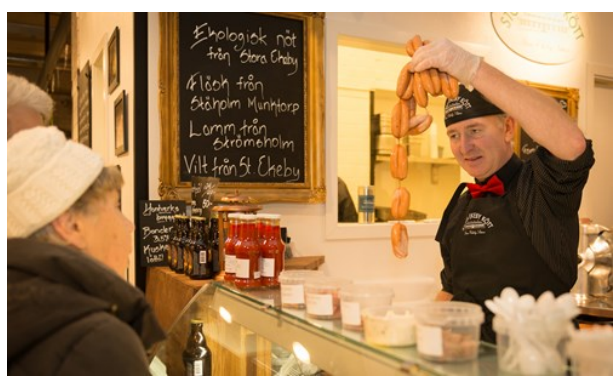
Saluhallen Slakteriet / Visit Västerås

If you're in the mood for a spending spree, then Västerås is the place for you! The city centre is bursting with international chains, small independent shops and wonderful indoor shopping centres. Outside the city centre, you will find the thriving retail park Erikslund with new shops constantly springing up. So come to Västerås and shop 'til you drop!