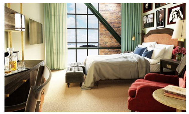
The Steam Hotel

Västerås is home to three of the world's most unique hotels: spend the night under water at Hotell Utter Inn, sleep among the treetops at hotell Hackspett or float around on what looks like the roof of a house in the middle of Lake Mälaren. There are, of course, plenty of hotels,