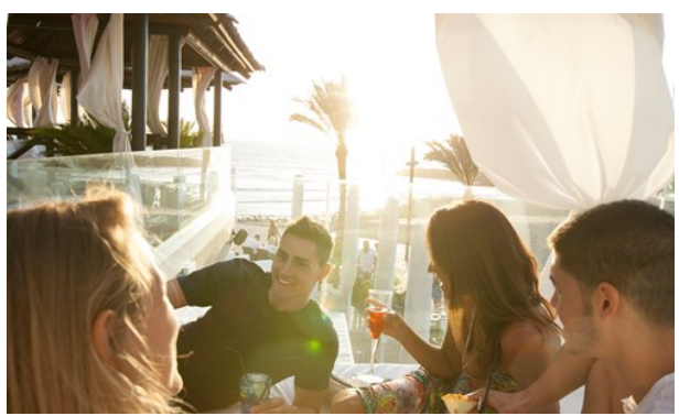
Turismo de Canarias

When the sun goes down, Tenerife truly comes to life. Our excellent climate allows you to enjoy a drink at an open-air terrace bar any time of the year. Some have sea views, others are in parks, amid busy shopping streets or at peaceful marinas. Find more information and events at: