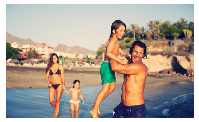
Turismo de Canarias

On the island there are around 70 kilometres of beaches where you can enjoy a variety of activities, including pedalos, jet skis and parasailing. Or you can just relax, let the sea breeze cool you down and have a quick dip whenever you fancy. Most beaches on Tenerife have been awarded the Blue Flag for the quality of the water, the services available and their easy access. Beaches with golden sand are mainly to be found in the south, from Güímar to Adeje. Las Vistas, Las Galletas, El Médano, Torviscas and Fañabé are some good examples. For more information, visit: