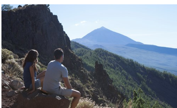
Turismo de Canarias

Tenerife is a volcanic island in the Atlantic Ocean where winter feels like spring thanks to the fabulous average year-round temperature of 23°C. A place where the people are genuinely friendly, an idyllic paradise with such diverse scenery you'll think you were at a thousand places around the world at the same time, or even on the moon: the Teide National Park (a huge volcanic area straight out of the movies) will make you believe you've travelled to a different planet.