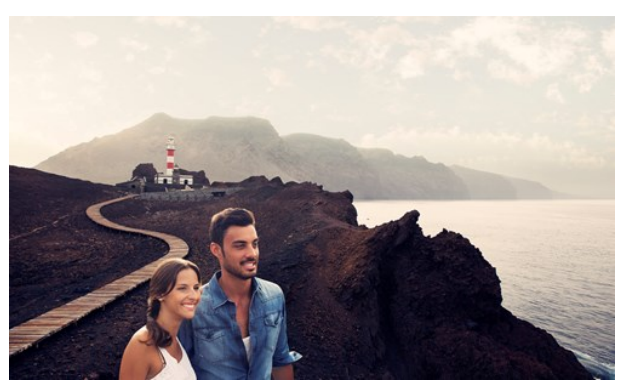
Turismo de Canarias