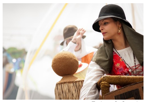
Turismo de Canarias