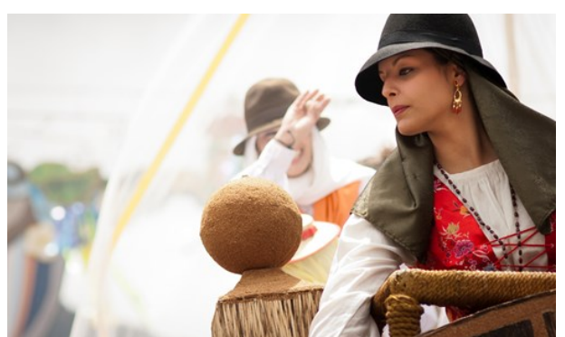
Turismo de Canarias

Tenerife is proud of its authentic traditions, fiestas, gastronomy and friendly people. Religious festivals and processions are a prime example of local culture, as are local festivals and the wonderful carnivals. To make sure you don't miss a thing, you can find information on all scheduled events at: