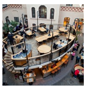
over the world.

Address: Centralgatan 6 Phone: +46 60 61 1891 Internet: http://www.innergarden.se/ Email: info@innergarden.se