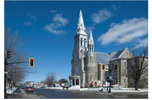
Yvan leduc / Wikimedia Commons