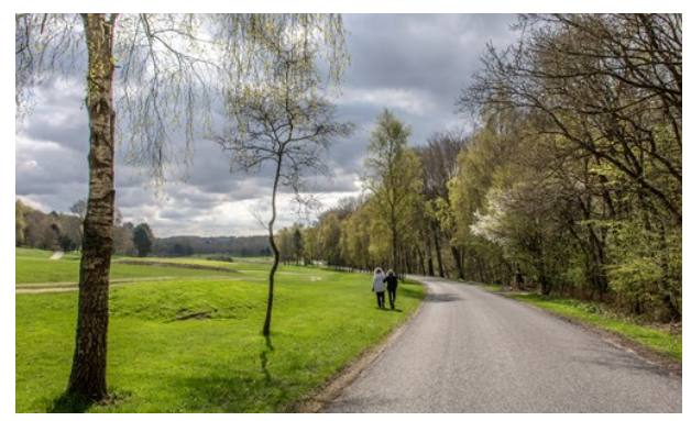
(image cropped)

Randers is, as probably every town in Scandinavia, known for its beautiful surroundings but there are also many places to see, and way more venues to explore. While the art scene is especially lively, your historical knowledge will also get somehow refreshed by establishments that focus on subjects that you probably never really thought of before.