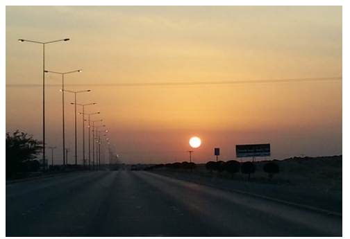
shalika Malintha / Flickr