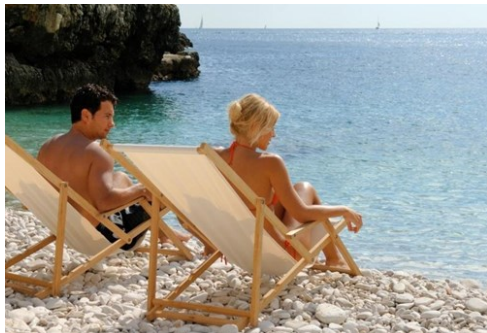
Istria Tourist Board

Jewel of the verdant peninsula of Istria, Pula is the province's largest city and forms a dramatic gateway to the seductive, crystalline waters of the Adriatic. Situated at the southernmost tip of the area, which has come to be known as 'the new Tuscany' for its bright medieval hilltop towns and ancient ruins, Pula boasts a rich and varied cultural heritage. The city is bordered by national parks remarkable for their astounding unspoilt natural beauty and is celebrated for its wonderfully preserved Roman amphitheatre and forum, which form a dramatic backdrop for leisurely strolls from the old town to the coast.