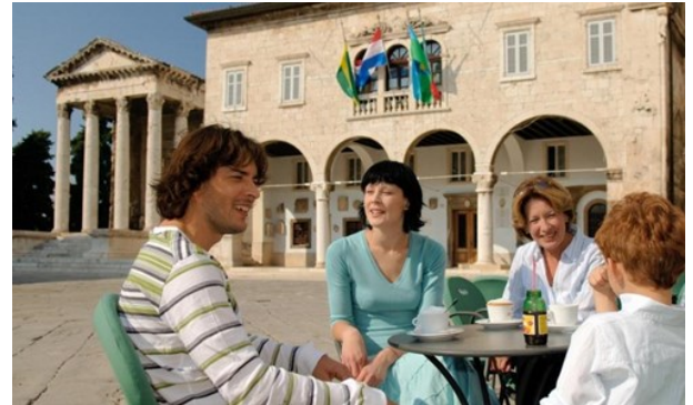
Istria Tourist Board

Pula offers a mixture of attractions for those interested in culture and history. Here you can see beautiful attractions like the Roman Amphitheatre, Ancient Cathedral, Old Town and the Temple of Augustus. Pula also offers fun family entertainment like the Aquarium with open tank with all kind of sea life. A great tourist asset is Pula's 190 kilometre of coastline with crystal clear sea and beaches that suit everyone's needs. If you would like to go for a short trip then Brijuni National Park is a great choose, located in an island close to Pula.