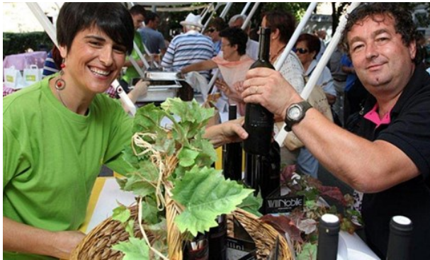
Istria Tourist Board

Pula's bustling central market is built in the heart of the city and is home to a wide range of modern and traditional shops. Under the glass arches of the 19th century iron framed covered market, you will find the area's largest fish market, which is best visited early in the morning when the brackish catch of a truly vast range of seafood is at its freshest. Look out for Brancin (sea perch) and fresh Dagnje (mussels), which are specialities of the region.