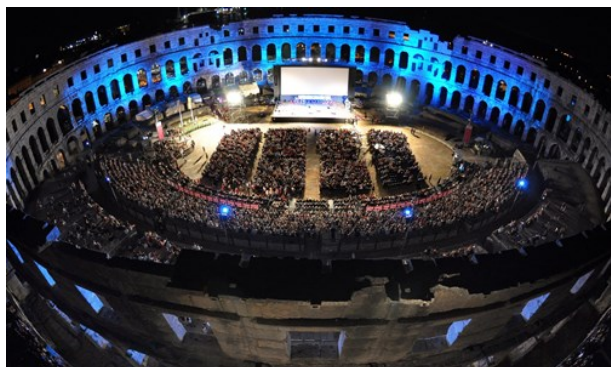
Istria Tourist Board

Laws in Pula restrict bar opening hours, meaning that most venues are closed by midnight and nightlife is limited to a number of bars in the Veruda area of the city as well as a few larger clubs northeast of the centre. Although local law forbid city-centre bars from opening beyond midnight, Pula does have a number of sociable and picturesque venues just outside the middle of town.