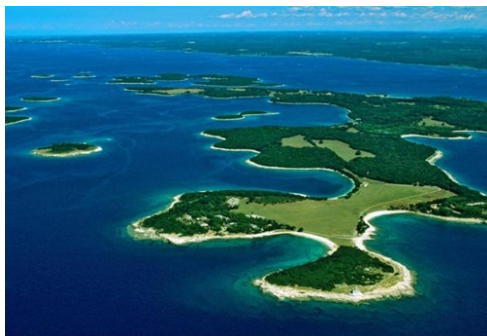
Istria Tourist Board

Jewel of the verdant peninsula of Istria, Pula is the province's largest city and forms a dramatic gateway to the seductive, crystalline waters of the Adriatic. Situated at the southernmost tip of the area, which has come to be known as 'the new Tuscany' for its bright medieval hilltop towns and ancient ruins, Pula boasts a rich and varied cultural heritage. The city is bordered by national parks remarkable for their astounding unspoilt natural beauty and is celebrated for its wonderfully preserved Roman amphitheatre and forum, which form a dramatic backdrop for leisurely strolls from the old town to the coast.