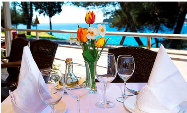
Istria Tourist Board

As a result of its proximity to Italy and its wealth of glorious coastline, Istria has a varied, fresh and sophisticated cuisine which draws on influences from across the Mediterranean and the Adriatic coasts.