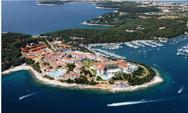
Istria Tourist Board

Pula has a mix of accommodation in and around Pula in every categories. You can find many hotels in the centre and large resort hotels in the area called Verudela. For beach holiday the hotels around Verdula would be a great choice due to the easy access to the beaches and sport activities. If you desire to experience the "real Pula" and check out the museums then it is advised to stay in the town centre.