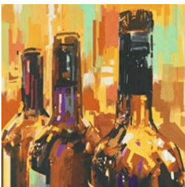
For all culture vultures, there is the LABIRINTHO bar that attracts a mixed clientele. This is not only a bar but also an art gallery, perfect for both