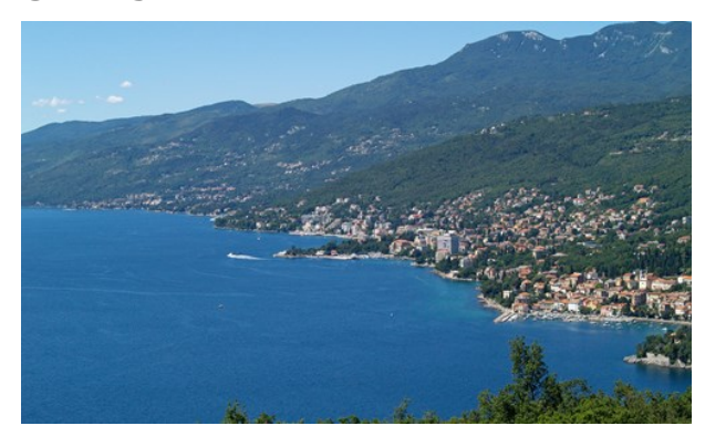
Opatija Tourist Board

The Opatija Riviera is a place that according to Slavic mythology was chosen by the gods who inhabited the slopes of Mount Učka, and it was also a resort for kings and emperors in the late 19th century. Today, it still offers spectacular scenery and royal treatment to every visitor. The Riviera is named after Opatija, a town that was the cradle of modern European tourism and which has for more than 170 years been considered one of the most elite Mediterranean destinations.