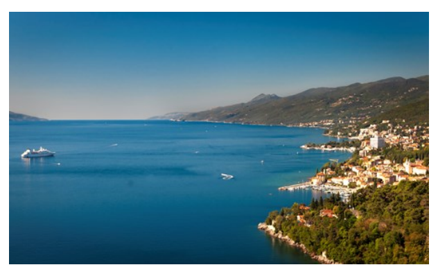
Opatija Tourism Office