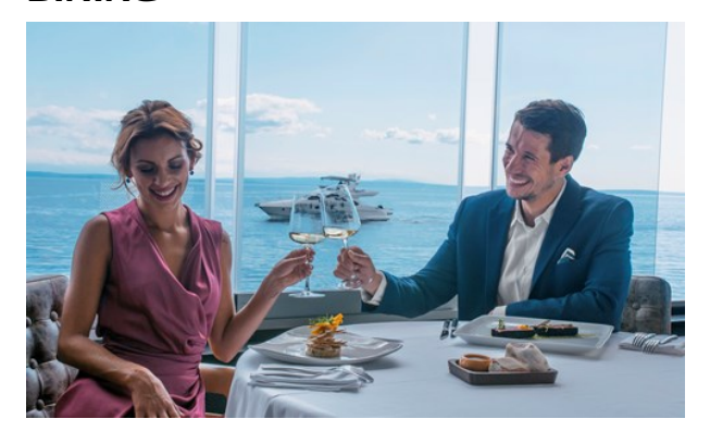
Opatija Tourist Board

Nouvelle cuisine showpieces or a rustic tavern where time has stood still? Whichever you choose, Opatija Riviera offers the best of both worlds!