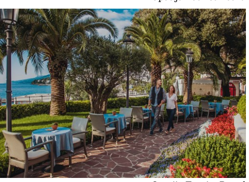
Opatija Tourist Board