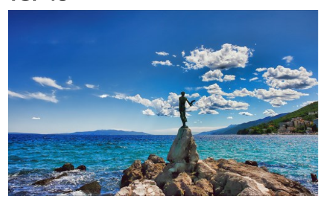
Opatija Tourist Board