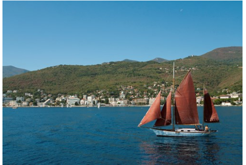
Opatija Tourist Board

Opatija, often called the queen of the Adriatic, is one of Croatia's most famous destinations, boasting a tradition of welcoming visitors dating back more than 175 years.