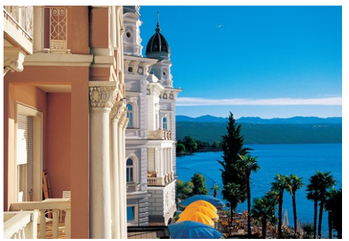
Opatija Tourist Board

Get to know Opatija, and let Opatija get to know you!