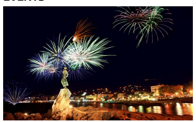
Opatija Tourist Board

Every season of the year has something special to offer on the Opatija Riviera. The area's numerous festivals and events dedicated to music, film, theatre, food, culture or fireworks – to mention just a few – are always tailored to the time of year when they take place.