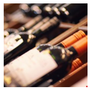
and lovely chocolate.

Address: 191 che du Mas de Cheylon, Nîmes Opening hours: Monday - Saturday 9.30am - 12.30pm, 2.30pm - 7pm Phone: +33 4 66 36 20 36