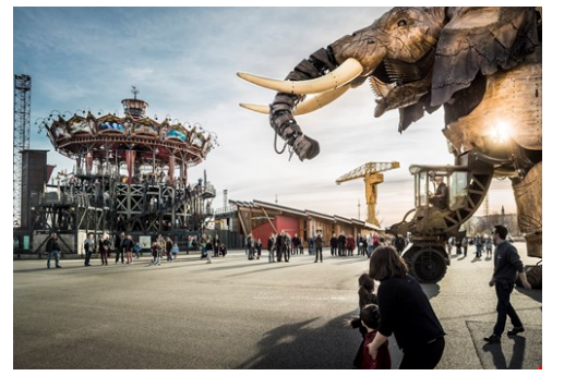
Machines de l'île