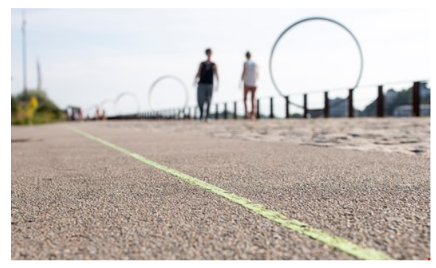
Follow the green line !

Just follow the green line ! Do you know of any other destination that – in one single kilometre – can bring together; a walk along the banks of the river Loire on a 12m high Grand Eléphant, a XVth century castle, a history museum that uses contemporary scenography to conjure the past, present and future and on top of that, an artistic trail designed by some of today's greatest artists? Come to Nantes to discover the "cité des ducs" and a single part of its rich architectural and cultural heritage. Nantes has 1,001 attributes; none more important than the one making you want to come on another journey in Nantes!