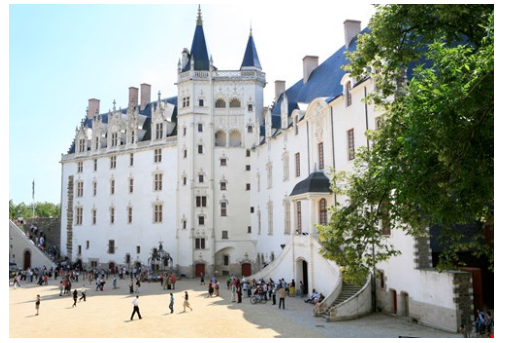
Château des ducs de Bretagne