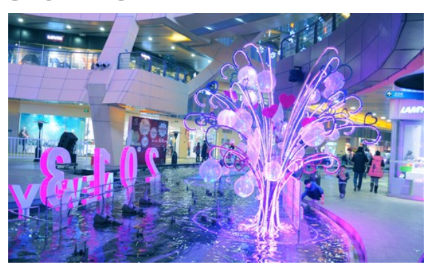
Sharon Hahn Darlin (image cropped)

Shopping in Nanjing is easy and hassle-free. The commercial districts are divided into specialised zones according to what is on sale there. The Xinjiekou - literally new street corner - Business Centre is a good first stop with all that a modern shopper could reasonably wish for, with mall