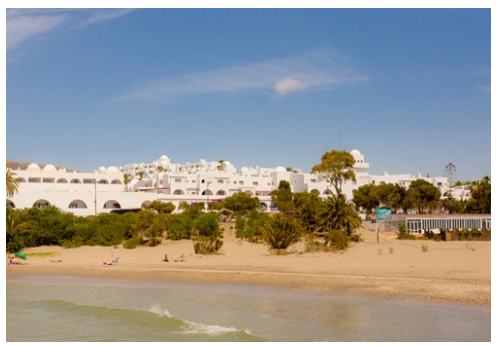
Ayuntamiento de Mojacar