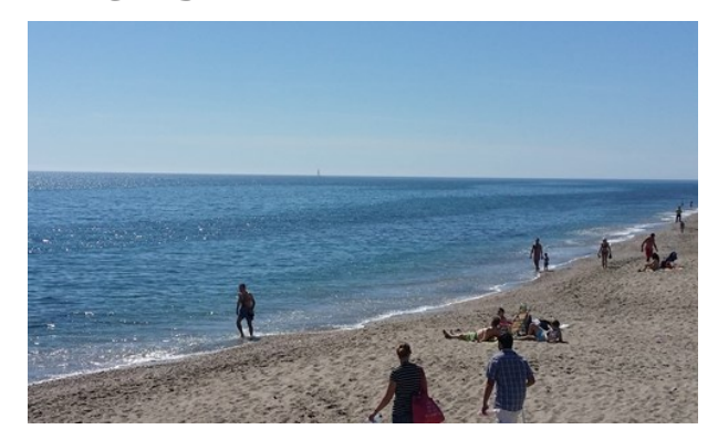
Carmen García Campoy

Mojácar's 17 kilometres of coast stretch from Marina de la Torre (in front of the golf course) on the border with Garrucha, to the Granatilla dry river bed in the impressively pretty outlying Sopalmo, just a few kilometres from the beginning of the Cabo de Gata-Níjar Natural Park andthe border with the municipality of Carboneras. Visitors can find virgin beaches, ideal for the most solitary, as well as more touristy beaches with numerous services.