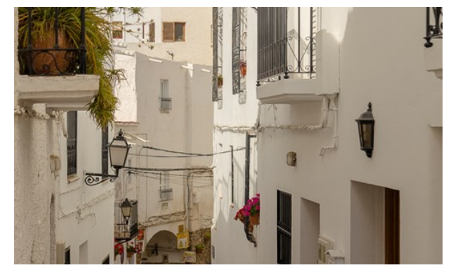
Ayuntamiento de Mojacar

For good reason, Mojacar's Old Town is considered one of the most beautiful in Spain. Many structures from Arab times still stand, and from the viewing points, you can enjoy the most beautiful horizons, both towards the sea and inland.