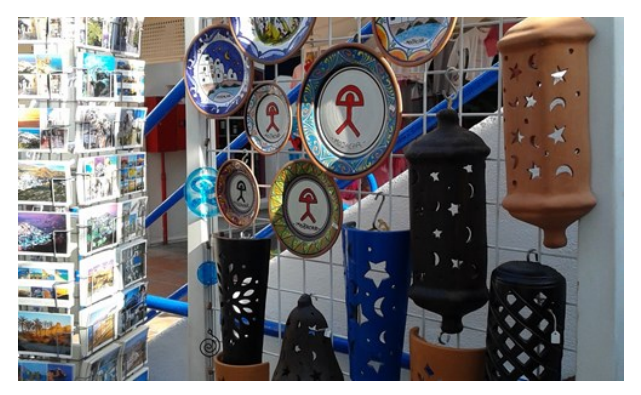
Carmen García Campoy

Mojácar is full of small and hospitable shops which specialize in hand-made goods. These stores are scattered around the narrow cobbled streets of whitewashyed houses with blue painted wooden window.