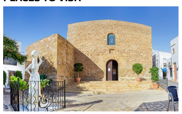
Ayuntamiento de Mojacar

With wonderfully preserved Arab structures, an impressive 16th century Church and a viewpoint offering stunning views of nearby beaches, this is a perfect day trip for all those interested in history.