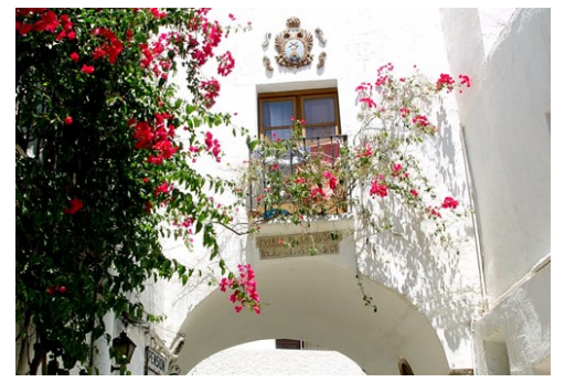
Ayuntamiento de Mojácar

Beautiful horizons await you in Mojacar. From the cluster of white houses, clinging to the very end of the Sierra de Cabrera foothills, to the warren of narrow streets, every corner of this quaint Spanish town is as captivating as the last.