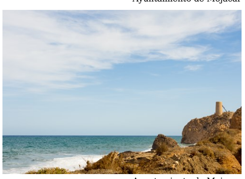
Ayuntamiento de Mojacar