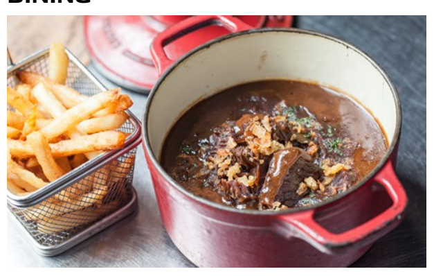
Bastia an image\ stock/Shutter stock.com

Those looking to savour Lillois specialities should cast their glance at carbonade flamande, waterzooi, and potjevleesch. The latter one might be the most exotic: four different types of meat held together with gelatin, served cold. Carbonade flamande is, perhaps, the safest bet, as little can go wrong with beef stewed to utmost