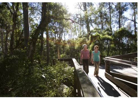
for Jervis Bay