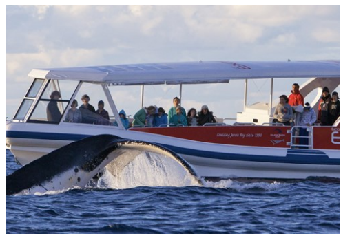
Dolphin Watch Cruises/Destination NSW for Jervis Bay