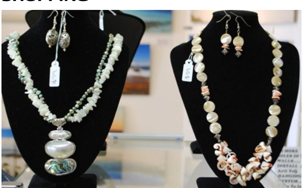
for Jervis Bay

Discover exquisite Aboriginal craftmanship and artworks in Jervis Bay and find treasures in the region's many arts and crafts markets, and browse for beach fashions and local handmade jewellery in boutiques.