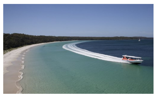
Dolphin Watch Cruises/Destination NSW for Jervis Bay

Jervis Bay is easy to reach from Sydney by driving or catching public transport.