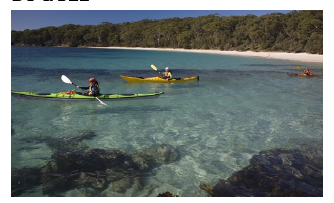
for Jervis Bay

Discover Jervis Bay's cultural heritage in its museums, historical sites and along scenic walks in the beautiful national parks and on uncrowded beaches. Wriggle your toes in the fine sands at Hyams Beach, famous for its brilliant white sands. Enjoy dolphin- and whale-watching tours in this paradise on the majestic NSW South Coast.