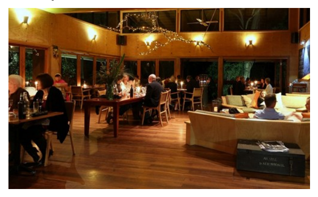
Destination NSW for Jervis Bay

Taste delicious cuisine, from modern Australian to Thai and Mexican, or enjoy a memorable experience dining among the treetops at The Gunyah Restaurant. You'll also find fresh fish and chips at charming bayside towns.