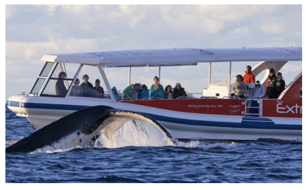
for Jervis Bay

Experience nature up close in the unspoilt region of Jervis Bay. Explore Booderee National Park on a bushwalk, go stand-up paddleboarding or kayaking with resident dolphins in the sparkling waters of the marine park, or enjoy whale watching from a coastal lookout.