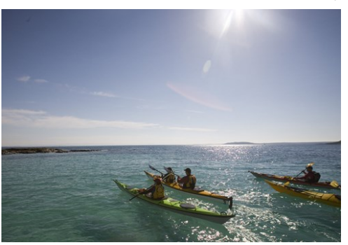
James Pipino/Destination NSW for Jervis Bay

Explore beautiful Jervis Bay within the unspoilt region of the NSW South Coast. Discover fine white sands and crystal clear waters in a marine park home to dolphins and seals. You'll also marvel at majestic whales as they migrate along the coast. Enchanting national parks are great for bushwalking and are filled with native wildlife and fascinating Aboriginal heritage. Enjoy water activities including kayaking, boating, fishing, diving and surfing. This magnificent region offers relaxation in spectacular settings where you can do as much or as little as you choose.