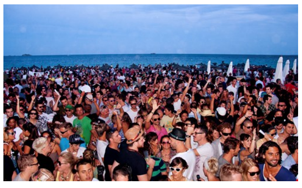
Un Mar de Gente/Flickr (image cropped)

Ibiza's bars set the scene for the incredible nightlife to come. Drinks are a little cheaper here than in the clubs, and most bars (unlike clubs) have free entry. There are club ticket deals and sometimes promotional offers on free chupitos (shots).