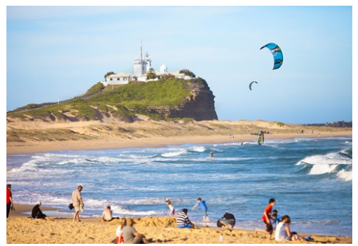
Newcastle Council/Destination NSW for the Hunter

Australia's oldest wine region is a beautiful destination. From fine wine and gourmet food to elegant accommodation and fabulous events, a Hunter Valley getaway offers a taste of the good life. Australia's most visited wine region is home to 150 top-class wineries, vineyards and cellar doors. Whether you're wine tasting, being pampered in one of the valley's day spas, or teeing off from a championship golf course, you'll enjoy a warm country welcome in the Hunter Valley.