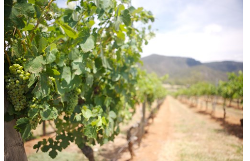
for the Hunter Valley

Australia's oldest wine region is a beautiful destination. From fine wine and gourmet food to elegant accommodation and fabulous events, a Hunter Valley getaway offers a taste of the good life. Australia's most visited wine region is home to 150 top-class wineries, vineyards and cellar doors. Whether you're wine tasting, being pampered in one of the valley's day spas, or teeing off from a championship golf course, you'll enjoy a warm country welcome in the Hunter Valley.