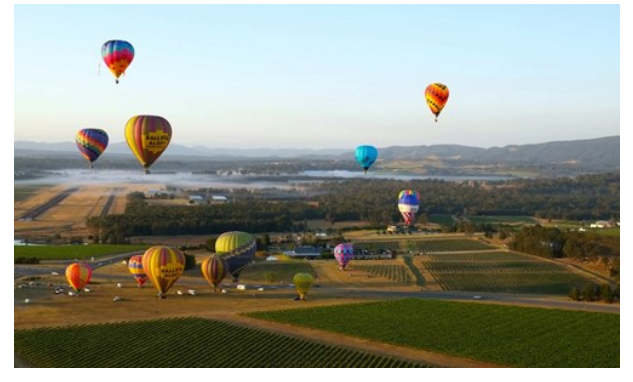
Destination NSW for the Hunter Valley

In addition to exceptional food and wine, the Hunter Valley offers many delightful experiences and adventures. This is a place where nature is on a grand scale with extraordinary environmental diversity. And you'll find the fascinating history and lively cultural scene enchanting.