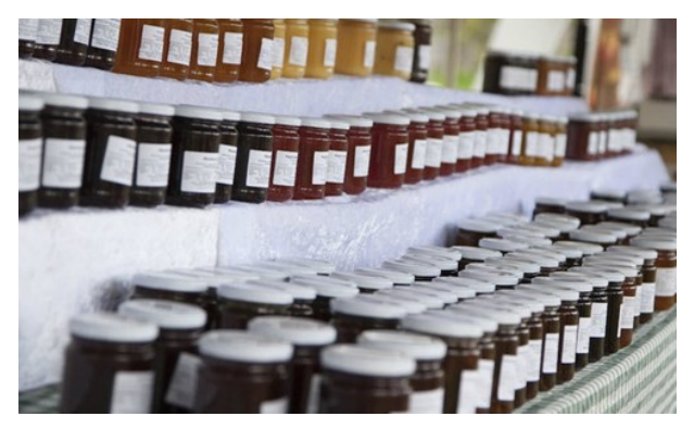
Destination NSW for the Hunter Valley

The strong local food culture has given rise to gourmet produce houses, wine education centres and weekly growers markets at townships throughout the valley.