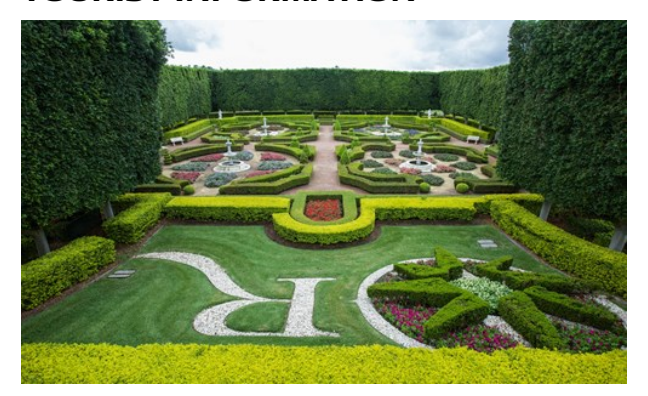
Hunter Valley Wine and Food Month

There are many ways to reach the Hunter Valley. Rent a car and enjoy the independence of exploring the region at your own pace, or relax as someone does the driving for you on a tour of the region.