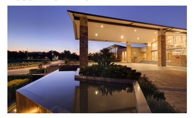
Destination NSW for the Hunter Valley

The Hunter Valley offers an enviable range of places to stay, from stylish hotels, resorts and spa retreats to country-style guesthouses and beautifully appointed bed and breakfast options. Some are nestled among the vineyards or within the wilderness of the Barrington Tops National Park, while others feature historical architecture unique to the region.