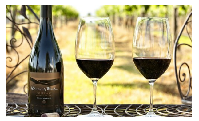
for the Hunter Valley

This is wine country, so sampling the region's award-winning drops is top of the to-do list. To experience nature visit the World Heritage-listed Barrington Tops National Park. For a bird's-eye view, enjoy an exhilarating balloon ride over the verdant valley and marvel at a glorious sunrise. Explore the gorgeous Hunter Valley Gardens and its themed gardens.