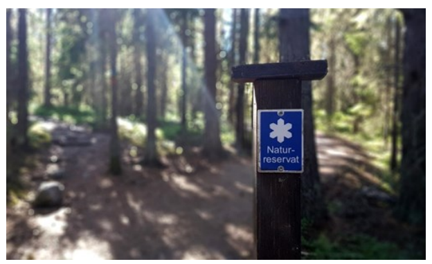
Höga Kusten Destinationsutveckling