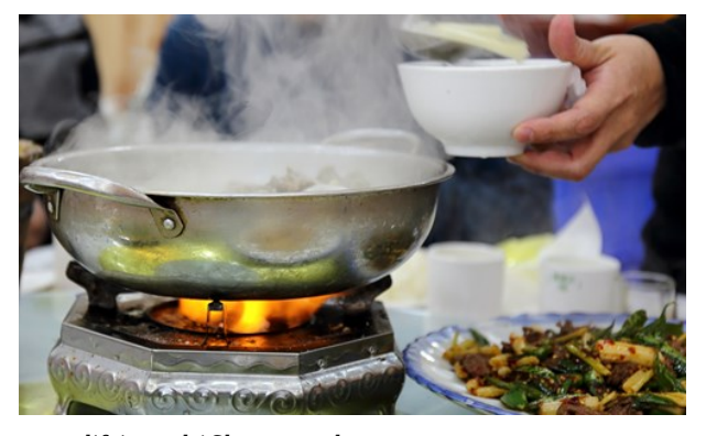
grass-life is good \ / \ Shutter stock.com

Hangzhou is famous for its traditional cuisine, hearty yet light on the palate. Some of the signature dishes are Beggar's Chicken baked in fragrant lotus leaves, West Lake fish, which can be steamed or stewed, and Dongpo Pork stewed in soy sauce, a dish invented and named after ancient China's most famous poet nine centuries ago. This is a divine dish where the meat is cooked to such tenderness it melts in the mouth.