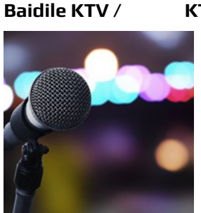
Address: West Street, Yangshuo County, Guilin

don't be surprised if an old Chinses lady starts speaking English with you. This is actually the place where the first contact with western culture took place and has since become the most international neighbourhood in Guilin.