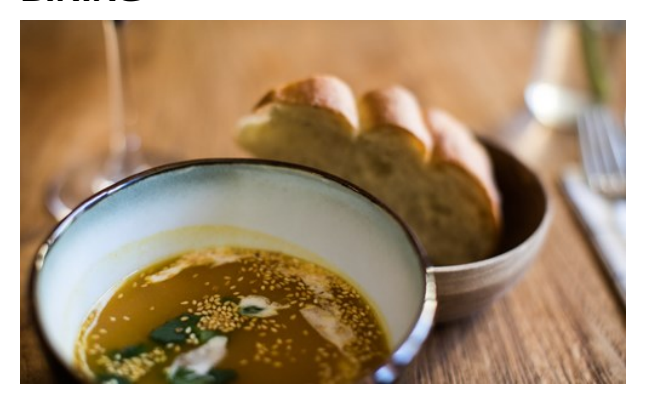
Stad Gent/Visit Gent

Love great food? You're in luck. Ghent is the place to be for the good life and great food. Ghent residents love to enjoy life. Whet your appetite during your weekend trip with the huge array of restaurants, bars and cafés in Ghent. Make your mouth water with gastronomic or fusion cuisine. Foodies will be right at home here. Ghent is the veggie capital of Europe, and its young rock-star chefs are causing a sensation on the international food scene. Taste. Enjoy.