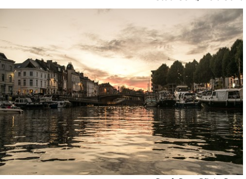
Stad Gent/Visit Gent