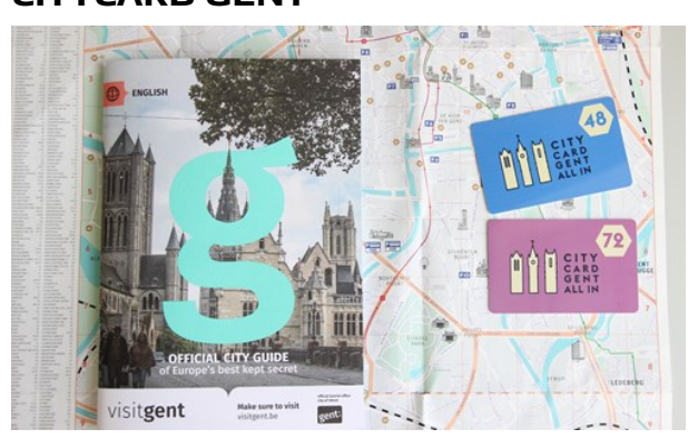
Stad Gent/Visit Gent

Unique in Europe...and we're not just saying that. Experience, taste and feel the vibrancy of Ghent: a surprisingly good deal. The all-in CityCard Ghent gets you into ALL the top attractions in Ghent, including public transport at a ridiculously low price. In short, with this card in your hand you can keep your wallet in your pocket for your entire city trip.