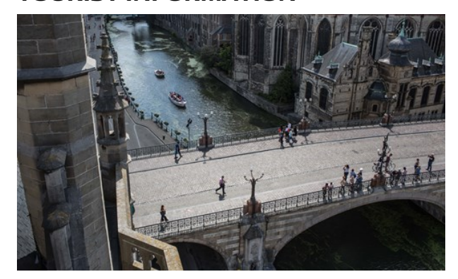
Stad Gent/Visit Gent