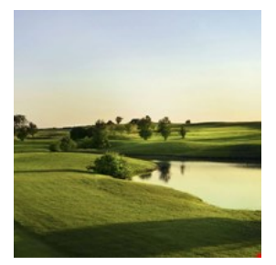
Address: Salomonhögsvägen 336, Båstad Internet: www.bjaregolfklubb.se