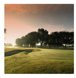
Address: Rya golfbaneväg 20, Helsingborg Internet: www.rya.nu