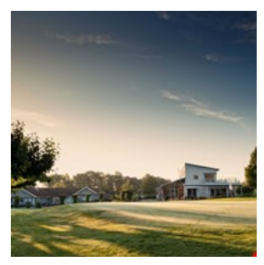
Address: Risekatslösavägen 8, Billesholm Internet: www.soderasensgk.se