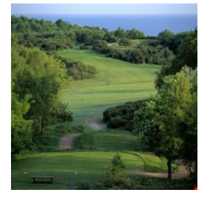
Address: Italienska vägen 215, Mölle Internet: www.mollegk.se