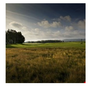
Address: Monomentvägen 2, Ljungbyhed Internet: www.ljungbyhedsgk.se