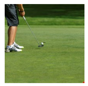
Address: Gustavsborg 501, Perstorp Internet: www.perstorpsgk.se