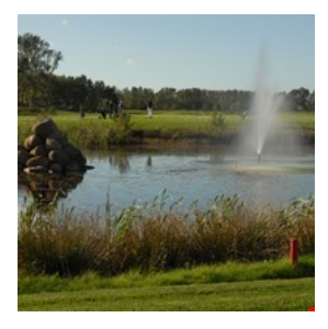
Address: Friluftsvägen 5, Lerberget Internet: www.hoganasgk.se