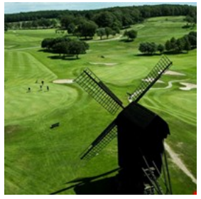
Address: Boarpsvägen 212, Båstad Internet: www.bgk.se