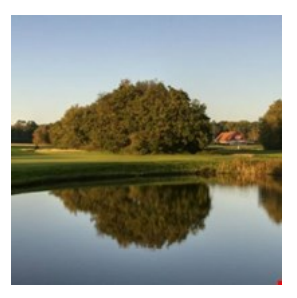
Address: Golfvägen 48, Skäret Internet: www.starild.se