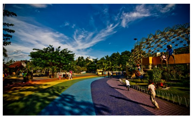
Reuel Mark Delez (image cropped)

Davao is famous for many things – eagles, gold, exotic flowers, eye-popping attractions and landscapes to name just a few. Look out for the Puentespina Orchids and Tropical Plants centre where the colours and scents will leave you bewildered, or the shops selling beautiful works in gold – the city is a major producer of gold and crafts.