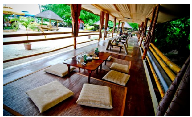
Reuel Mark Delez (image cropped)

Cafés and coffee shops are scattered throughout the city, but head to F. Torres Street and you surely won't find yourself at a loss - the avenue is lined with restaurants and cafés serving all manner of local and international food and drinks.