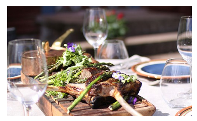
Visit Dalarna AB

Dalarna - a world of flavours. Discover the scents and flavours of Dalarna such as lingonberries, blueberries, game and mushrooms. Wander through one of Dalarna's welcoming little towns and stop off for a coffee or something ot eat.