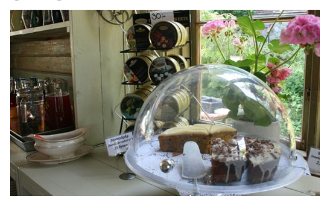
Visit Dalarna AB