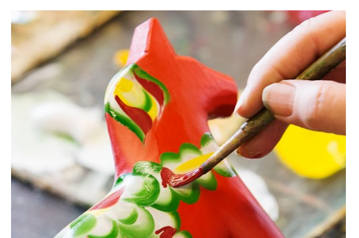
Visit Dalarna AB

Dalarna is often called "Sweden in miniature". Much of the popular imagery of Sweden, culturally and geographically, is from Dalarna; a pretty red-painted cottage by a glittering lake, in the evening sun, people in brightly-coloured folk costumes dance and swirl in celebration of Midsummer.