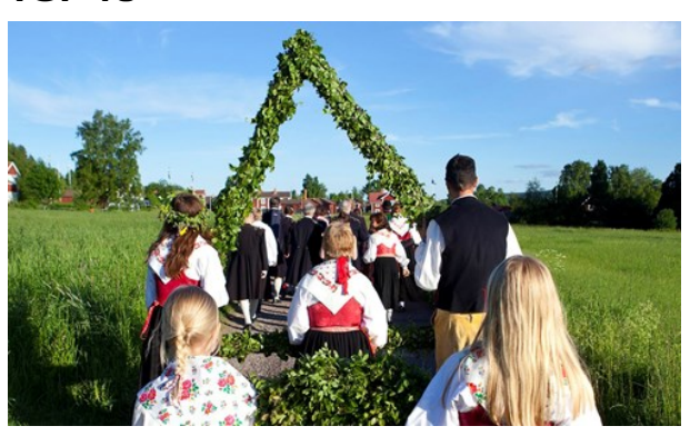
Visit Dalarna AB

There is a lot to see and do in Dalarna. Here is just a small sample of what we have to offer. We hope that you are going to enjoy it just as much as we do!