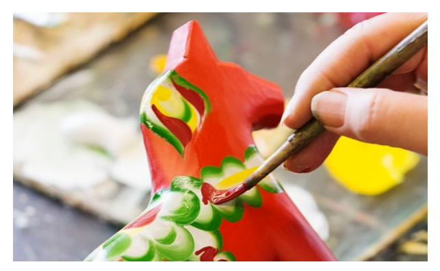
Visit Dalarna AB

Dalarna is often called "Sweden in miniature". Much of the popular imagery of Sweden, culturally and geographically, is from Dalarna; a pretty red-painted cottage by a glittering lake, in the evening sun, people in brightly-coloured folk costumes dance and swirl in celebration of Midsummer.