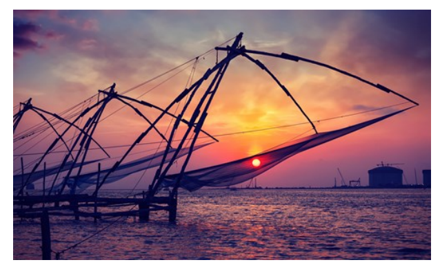
DR Travel Photo and Video

No matter the amount of time you allocate to Cochin, you will always have too little. Because of the city's rich historic background, there are plenty of sites, museums and attractions to visit. Take a stroll along the scenic Chinese fishing nets or visit one of the religious buildings. Make sure you don't lose track of time, since there is so much to do and see in Cochin!