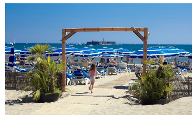
Office de Tourisme Cap d'Agde Méditerranée : J-C. Meauxsonne