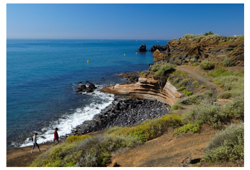
Office de Tourisme Cap d'Agde Méditerranée : J-C.