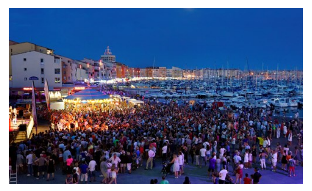
Office de Tourisme Cap d'Agde Méditerranée: H.Comte