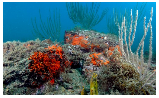
Renaud Dupuy de la Grandrive / Office de Tourisme Cap d'Agde Méditerranée