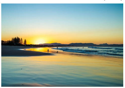
Destination NSW for Byron Bay