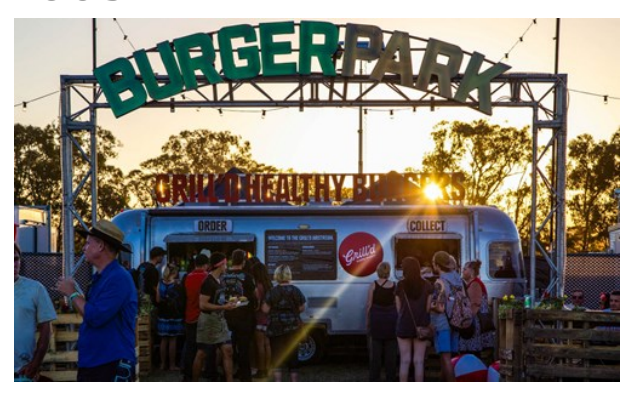
Destination NSW for Byron Bay

Byron Bay is a great place to get active, be it surfing, kayaking, sailing or swimming at a beautiful beach. Enjoy the thrill of skydiving and hand-gliding, and see a glorious sunrise from a hot-air balloon. Climb Mount Warning, an extinct volcano, and walk in World Heritage rainforest.