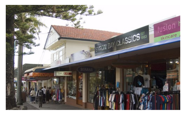
Destination NSW for Byron Bay

Home to a thriving arts community, delicious fresh produce and holistic wellbeing services, Byron Bay is a great for browsing, eating and relaxing. Enjoy festive markets and an array of shops on Jonson Street selling everything from beach clothes to handmade jewellery and crystals.