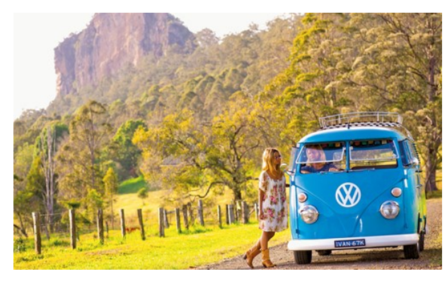
Destination NSW for Byron Bay

Byron Bay is a delight, from the moment you arrive to the time you leave. Visitor facilities have made the beachside town as easy as possible for you to come and go and to get around, whether you want to browse in town markets or relax on white sandy beaches, take guided tours, explore the beautiful region yourself or... do it all!