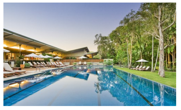
Destination NSW for Byron Bay

A popular tourist destination, Byron Bay has plenty of great places to stay to suit your budget and lifestyle. Choose from luxury hotels and resorts to self-contained apartments and bed breakfasts to hostels, backpackers, caravan parks and camping. You'll also find cabins, cottages and farm stays in Byron Bay and in nearby towns such as Bangalow, Mullumbimby and Brunswick Heads.