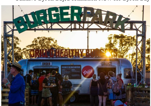
Destination NSW for Byron Bay

From World Heritage rainforest to sparkling beaches, the Byron Bay region on the NSW North Coast is full of natural wonders. The Aboriginal Arakwal people call it Cavvanbah - the meeting place. The area is also famous for its surf culture, alternative philosophies, organic food and outdoor adventures. Byron Bay's natural attractions are impeccable - humpback whales cruise past the headland, dolphins frolic in the bay and storms create rainbows on the mountains. People from all walks of life meet here, drawn by Byron Bay's vibrant energy.