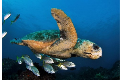
Sundive Byron Bay/Destination NSW for Byron Bay

From World Heritage rainforest to sparkling beaches, the Byron Bay region on the NSW North Coast is full of natural wonders. The Aboriginal Arakwal people call it Cavvanbah - the meeting place. The area is also famous for its surf culture, alternative philosophies, organic food and outdoor adventures. Byron Bay's natural attractions are impeccable - humpback whales cruise past the headland, dolphins frolic in the bay and storms create rainbows on the mountains. People from all walks of life meet here, drawn by Byron Bay's vibrant energy.