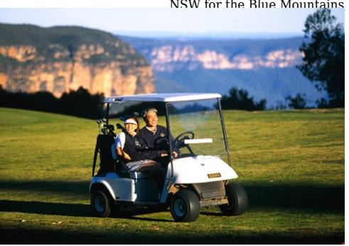
Hamilton Lund/Destination NSW for the Blue Mountains