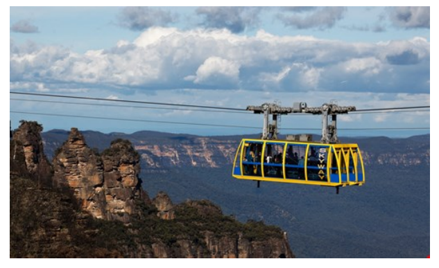
for the Blue Mountains

Breathtaking panoramas of giant ravines, sandstone plateaus, piercing pinnacles, vast forests and cascading waterfalls, and journeys into 340 million-year-old cathedral caves, are the amazing highlights of this World Heritage wilderness, near Sydney.