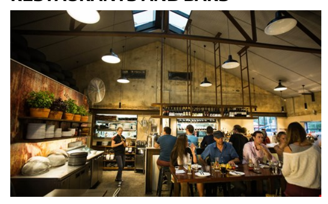
Destination NSW for the Blue Mountains

The Blue Mountains are home to many committed chefs who create delicious dishes using fresh seasonal produce for which the area is renowned. But it's not only the award-winning restaurants - boutique bakeries, artisan producers of fine foods, and farmers markets ensure the Blue Mountains have an abundance of great food. Influences include Asian, French and other European cuisine, but contemporary Australian is the typical menu choice attributed to the region.