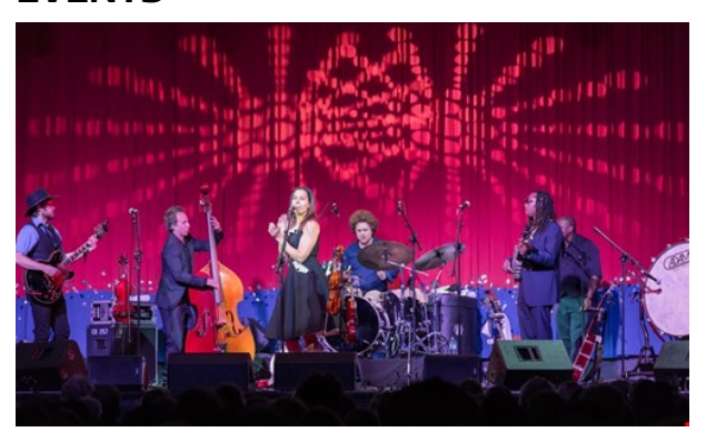
Destination NSW for the Blue Mountains