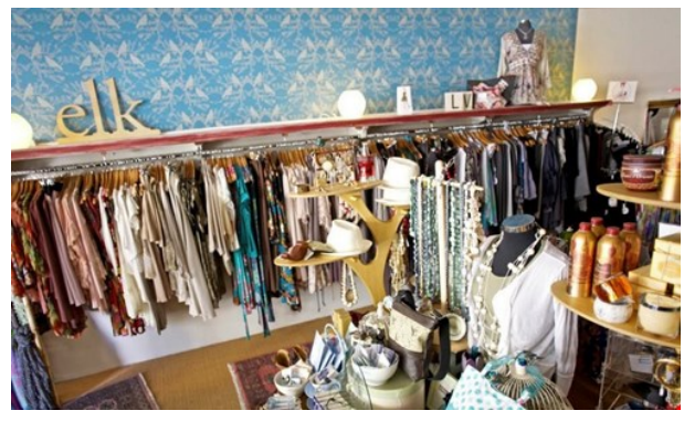
Destination NSW for the Blue Mountains

Shopping in the charming towns and villages is a delight. Artisan foods, fashion, memorabilia, splendid antiques and beautiful artworks can all be found in the Blue Mountains.