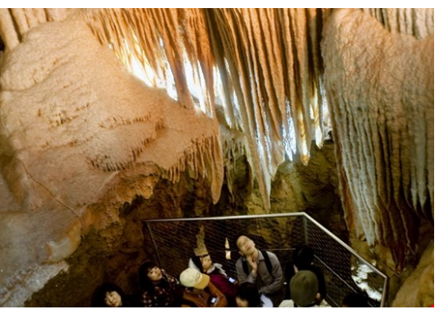
Lithgow and Oberon Tourism; David Hill/Destination NSW for the Blue Mountains