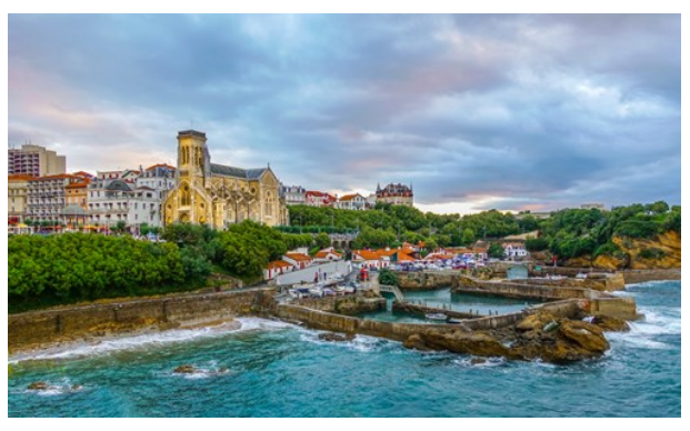
LuminatePhotos by judith/Shutterstock.com

Biarritz is located in Basque territory, 18km from the Spanish border. The sunny location on the Bay of Biscay makes it perfect for surfing and this culture is deeply rooted in the city's ambience. Several prestigious surf tournaments have been hosted by Biarritz. Other popular sports practised here are Basque pelota, golf and rugby.