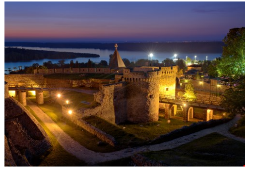
Tourist Organization of Belgrade