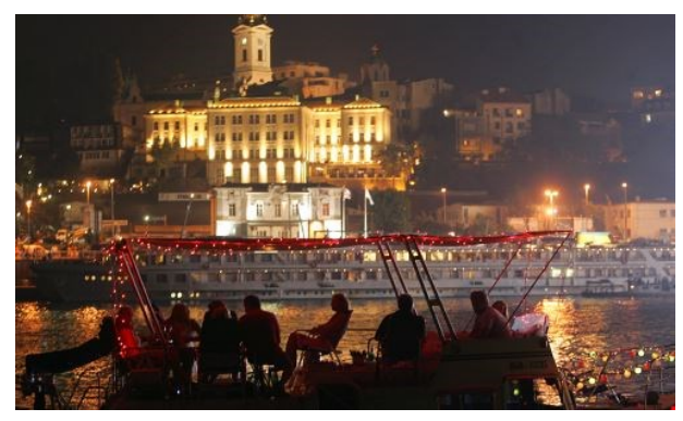
Tourist Organization of Belgrade

Belgrade is known as the City of Events. Its rich and diverse event calendar constantly invites citizens and guests from all over Europe and World to experience vibrant and live energy of Belgrade.