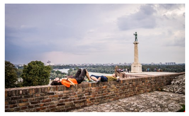
Tourist Organization of Belgrade

Belgrade has an abundance of cultural attractions and a wide range of events that draw visitors from across Europe.