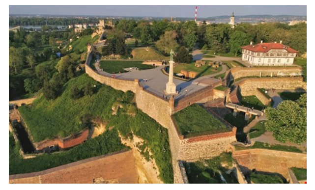
Tourist Organization of Belgrade

While there are a lot of interesting museums that Belgrade makes the city of culture, as well, such are: Military Museum, Museum of Automobiles, Ethnographical Museum, Museum of African art, Museum of Ivo Andric, Museum of Vuk and Dositej, Historical Museum and many others, here is the list of five that you shouldn't miss.