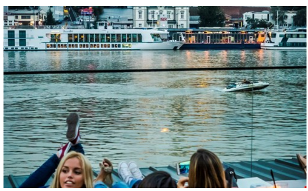
Tourist Organization of Belgrade

Explore Top 10 To Do things in Belgrade and explore the city by yourself. Get lost and wander around the streets, among the locals whereas if you wish to find your way back they will be more than welcome to show you around and mesmerize you with stories hidden behind the passengers' eyes.