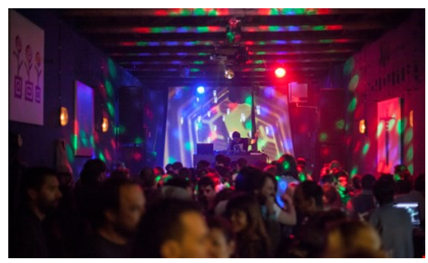
Tourist Organization of Belgrade

The new era of nightlife is on in Belgrade. Its logic is forever twisted into a crazy loop of partying, so do not miss top parties, extraordinary atmosphere, urban clubbers. Everything usually starts after midnight until the Sunrise on Belgrade Sava river.