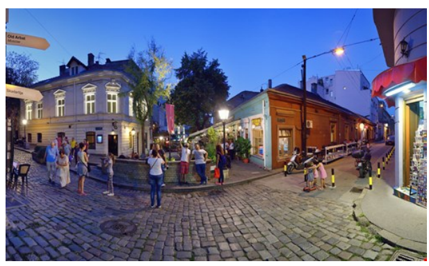
Tourist Organization of Belgrade

City of Culture, Inspiration, Sports and Festivals, Serbian capital is an exciting mixture of rich and diverse history, architecture and urban spirit. With some of the most attractive locations, Belgrade Fortress – the oldest cultural and historical monument, Skadarlija –bohemian quarter in the city center, Knez Mihailova Street; Old and New Palace, Federal Parliament, Temple of St. Sava, Zemun and many others, Belgrade makes the cultural center of South East Europe.