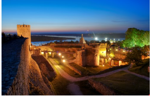
Tourist Organization of Belgrade