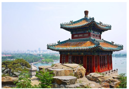
Parichart Patricia Wong/Shutterstock.com

Beijing's famous Tiananmen Square is big enough to hold one million people, while the historic Forbidden City is home to thousands of imperial rooms - and Beijing is still growing. The capital has witnessed the emergence of ever-higher rising towers, new restaurants and see-and-be-seen nightclubs. But at the same time, the city has managed to retain its very individual charm. The small tea houses in the backyards, the traditional fabric shops, the old temples and the noisy street restaurants make this city special.