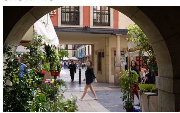
Nacho (image cropped)

Asturias (and Oviedo in particular) is famous for its handmade leather and calfskin goods, including handbags, shoes, coats and luggage. Some of the top shops in Oviedo are to be found on Calle Gil de Jaz, Calle Uria and the surrounding streets. Likewise, main shopping spots in other towns are concentrated in the city center.