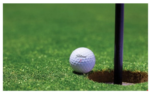
Ängelholms Näringsliv AB

Sweden's no. 1 golf destination. Ängelholm is located in the second area with the most golf courses in the world. Within a 40 minutes' drive, there are 25 golf clubs and 31 golf courses. Only Florida can boast more golf courses! The courses range from coast to inland and their difficulty ratings vary so that there is something for every type of player. Weather permitting, you can play all year round.