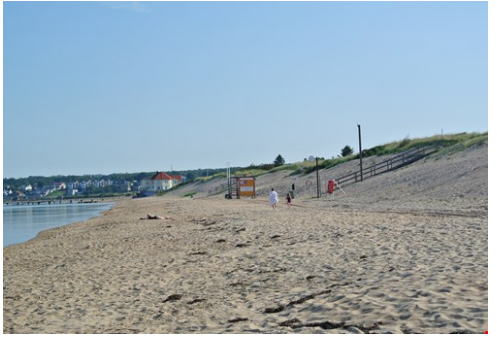
Ängelholms Näringsliv AB