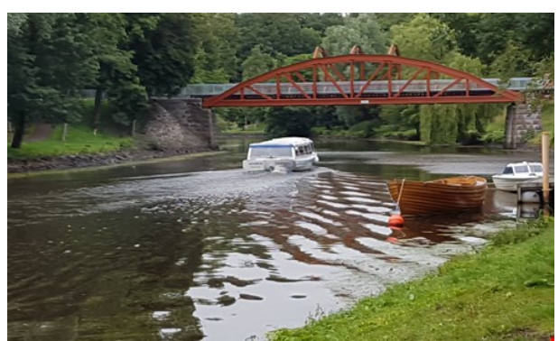
Ängelholms Näringsliv AB

With so much to do, our top five will set the pace for your holiday.