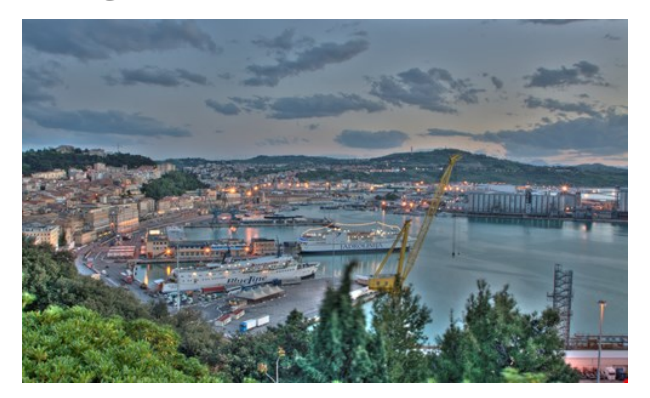
Enrico Matteucci (image cropped)

A harbour city, capital of the prosperous Marche region, Ancona has a rich history. Its name comes from the Syracuse word for elbow - Ankon - and the city has been a trading centre for at least 3,000 years, linking both coasts of the Adriatic Sea. This activity has left traces on the city's monuments, its buildings and its urban fabric. The city is surrounded by a beautiful landscape, with hills rolling into the sea. Ancona's mountain - Mount Conero - descends steeply into the water, and is now a regional park which protects its natural habitat.