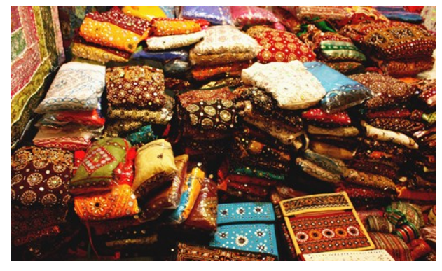
Sudhamshu Hebbar (image cropped)

Ahmedabad is the city of vibrant street life, which includes an abundance of day- and nighttime markets. Some of the most popular shopping areas to be after sundown are, of course, the Manek Chowk square in Old Ahmedabad and the Law Garden area. Vendors sell a huge variety of items, ranging from traditional clothing to handicrafts to foods. Haggling is welcome at markets, but fixed-price craft stores (many government-run) provide a great alternative for those looking for a more relaxed experience. Plenty of air-conditioned malls with international brand boutiques operate in Ahmedabad along with a large variety of small shops scattered throughout the city.