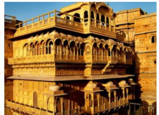
PATWON KI HAVELI