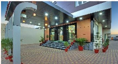
TRULYY RUDRANSH INN - JODHPUR