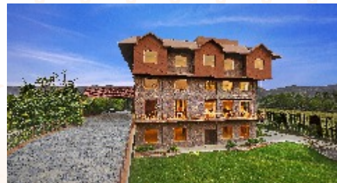
THE BAGH - RANTHAMBORE