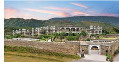
THE AMARGARH - UDAIPUR