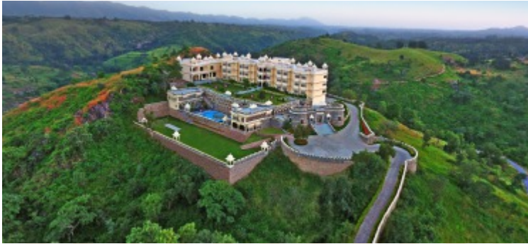
THE KUMBHA BAGH - KUMBHALGARH