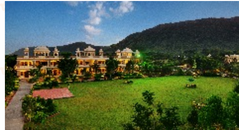
THE UDAI BAGH - UDAIPUR