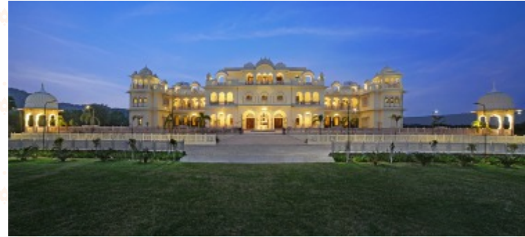
THE JAIBAGH PALACE - JAIPUR