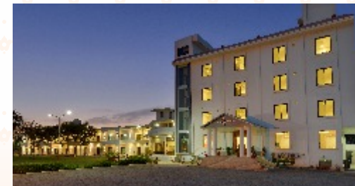
THE ELEGANCE - CHITTORGARH