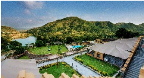
KUMBHALGARH SAFARI CAMP