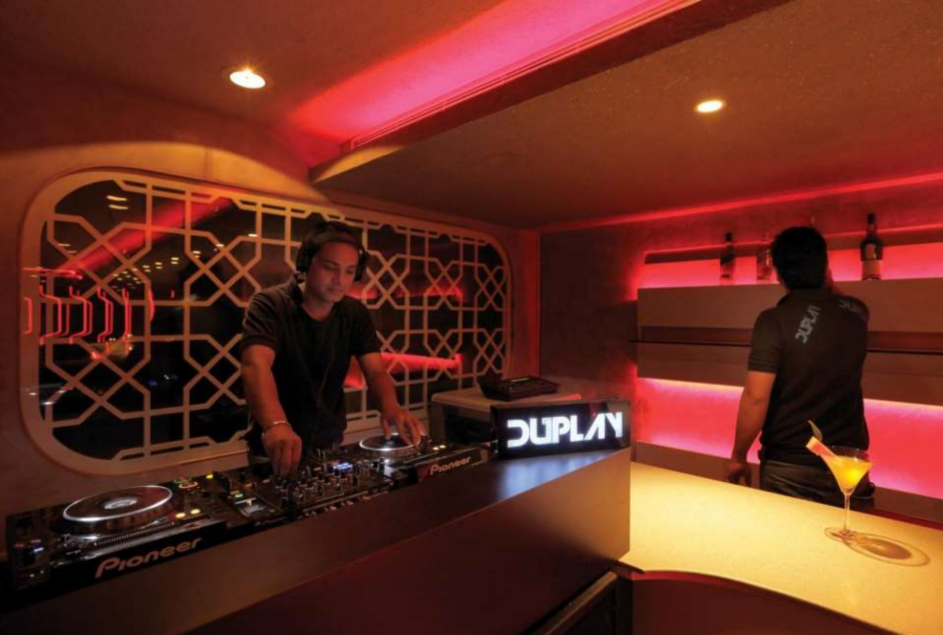
Duplay – Night Club