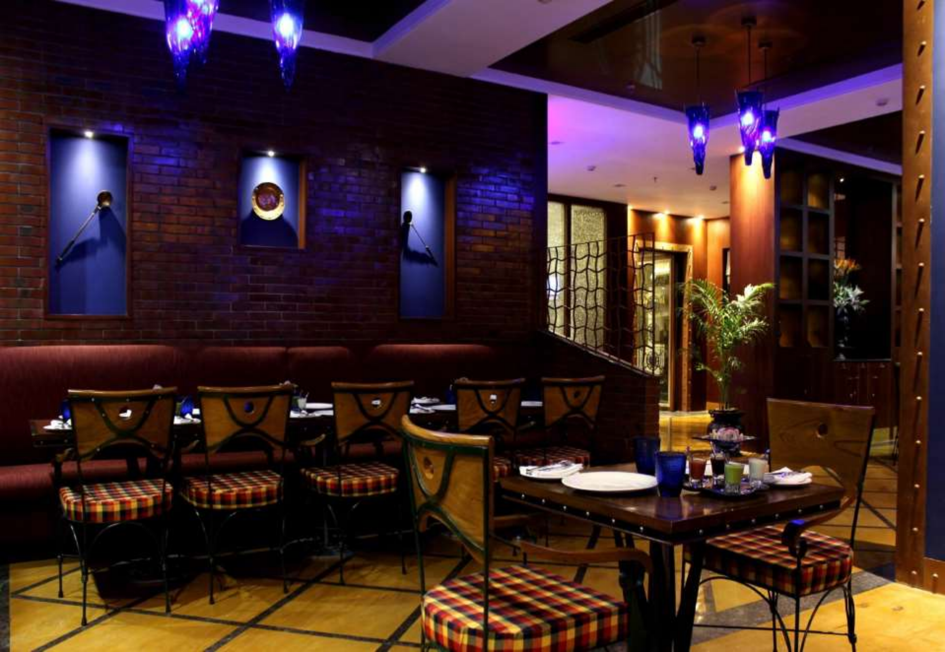
The Great Kabab Factory