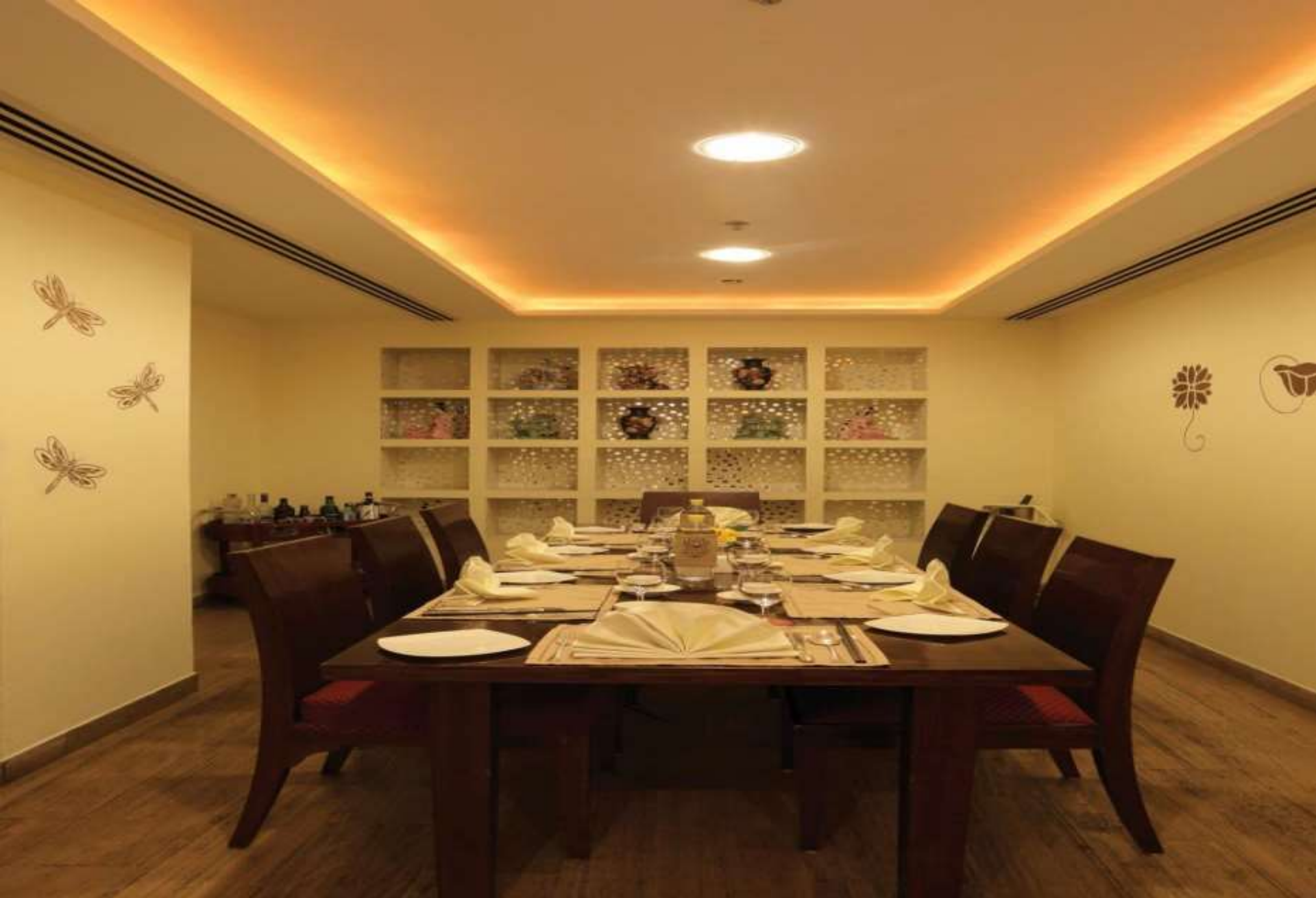
Dragon House – Private Dining