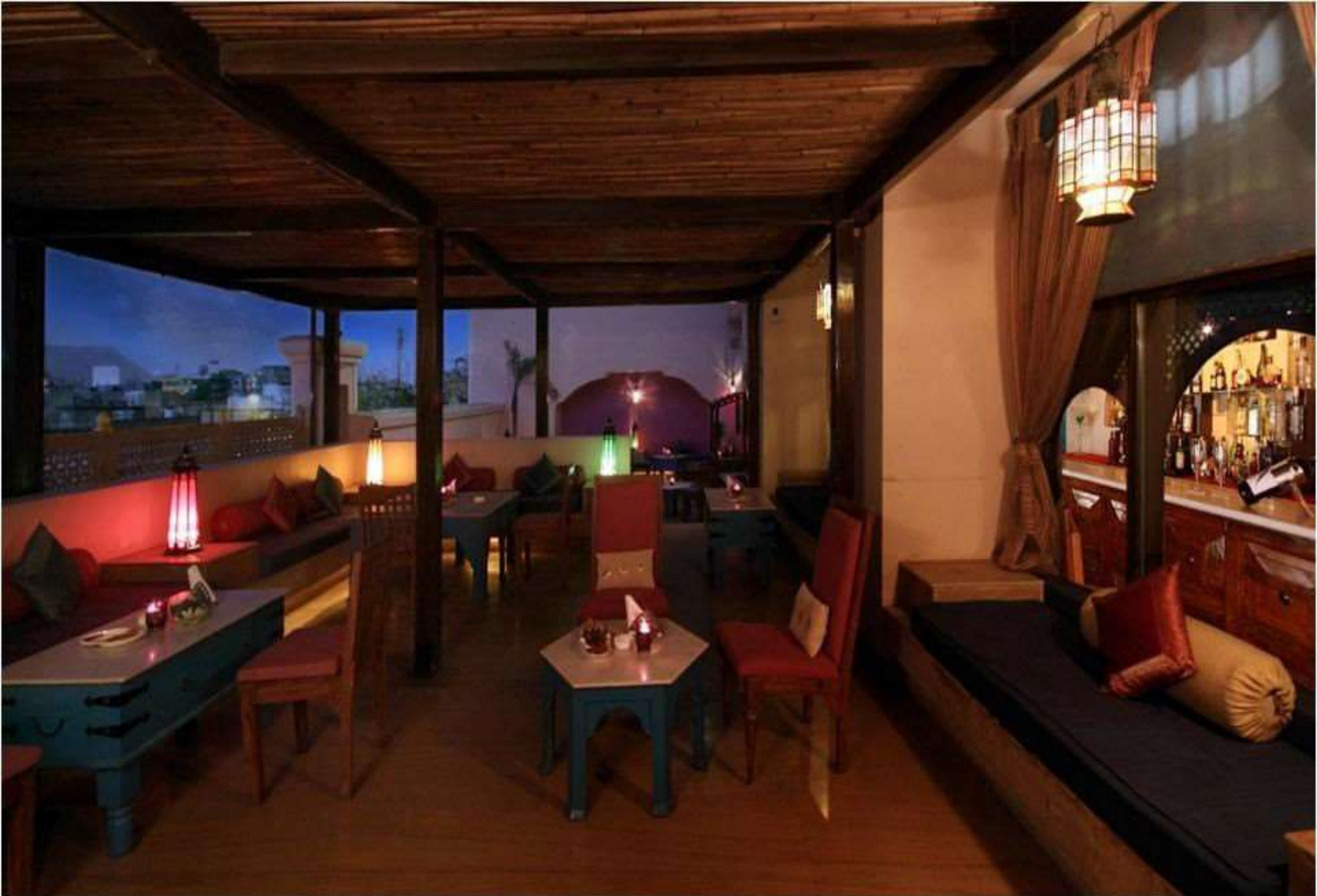
Kasbah Open Air Sitting – Overlooking Nahargarh Fort