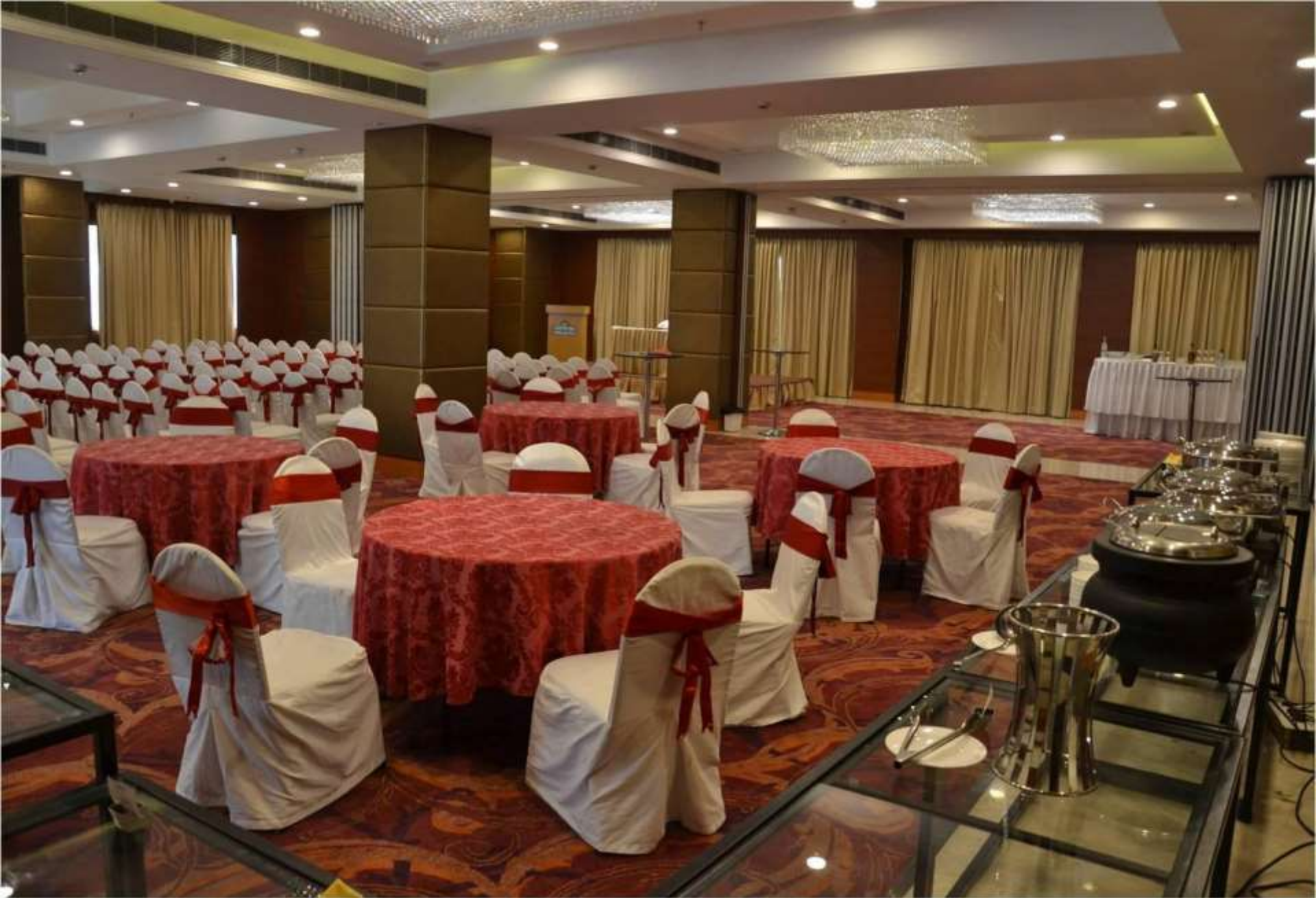
New Banquet: Ball Room