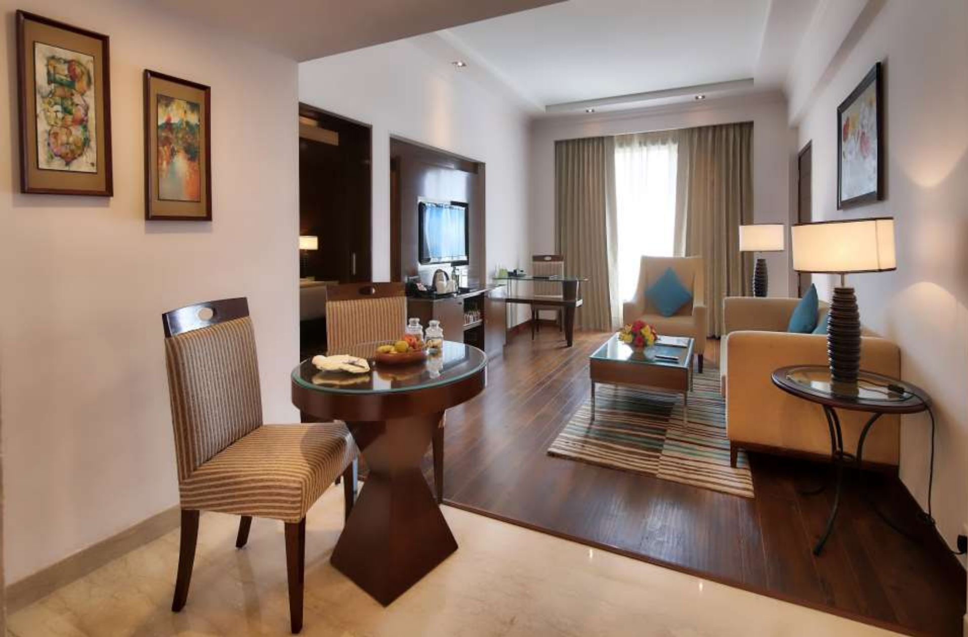
Radisson Suite Living Room