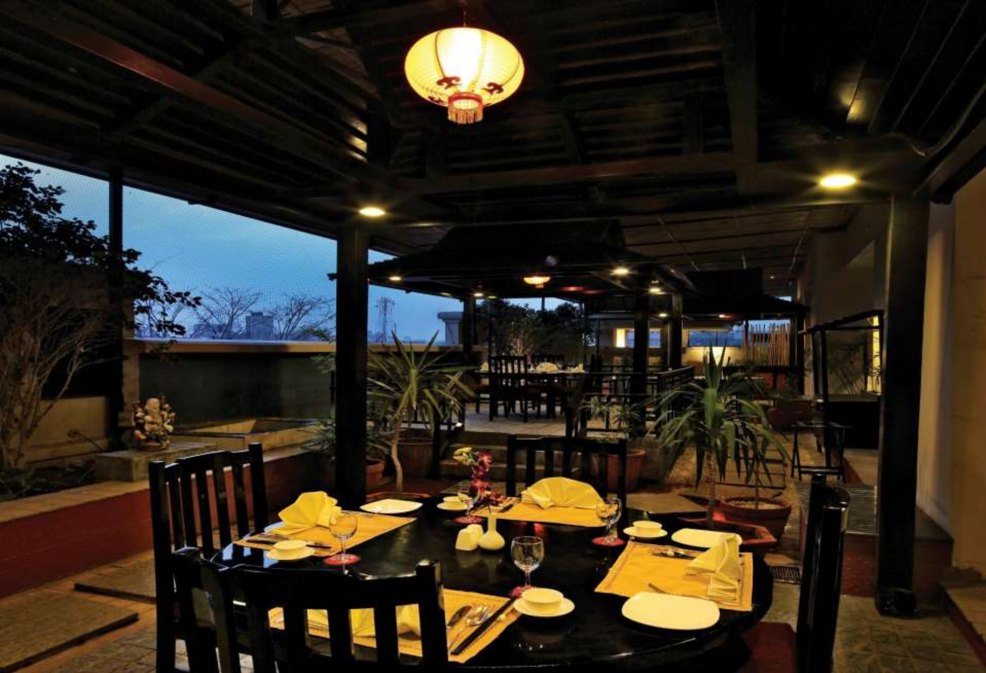
Dragon House – Pagoda Sitting