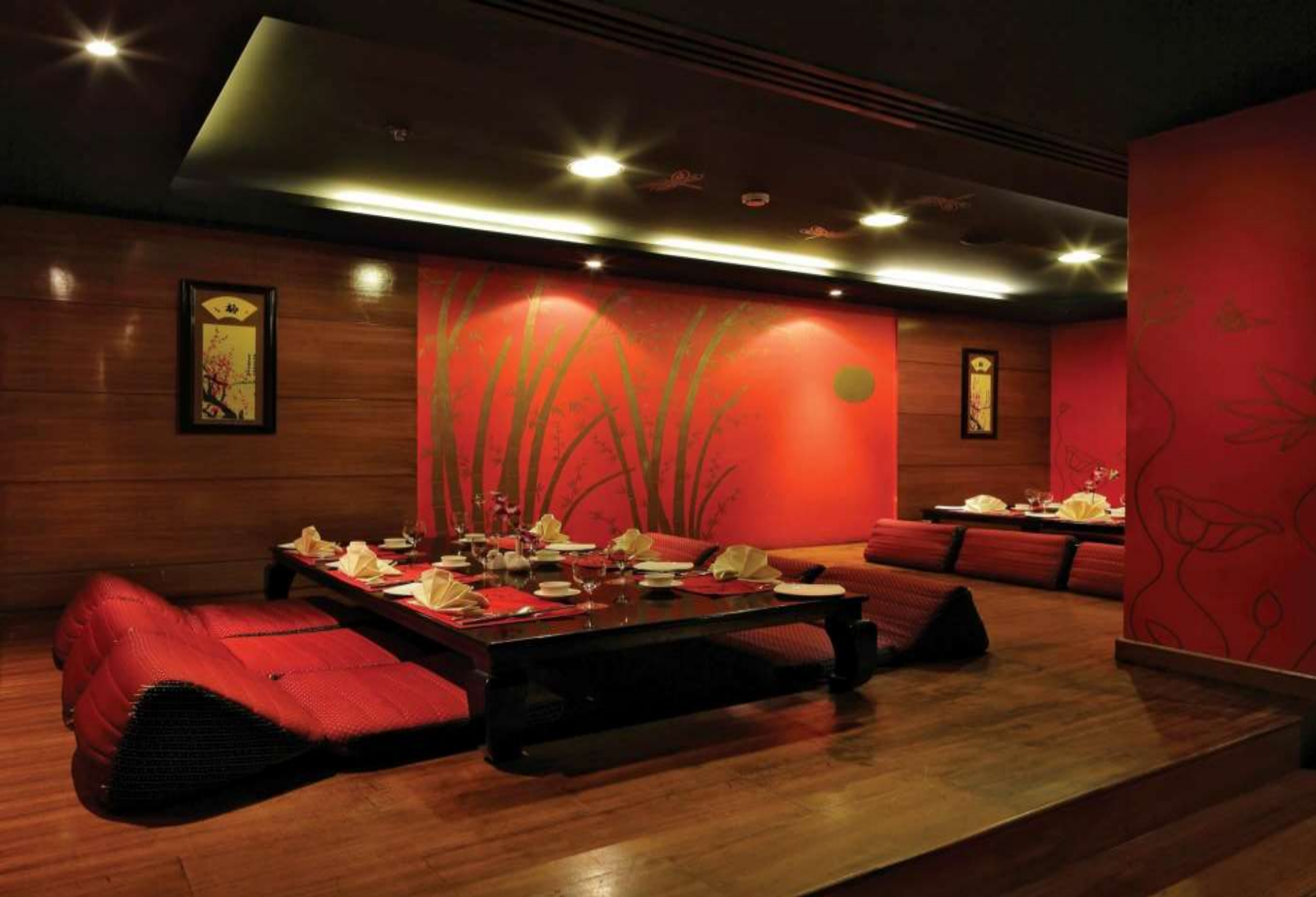
Dragon House – Chinmai Sitting