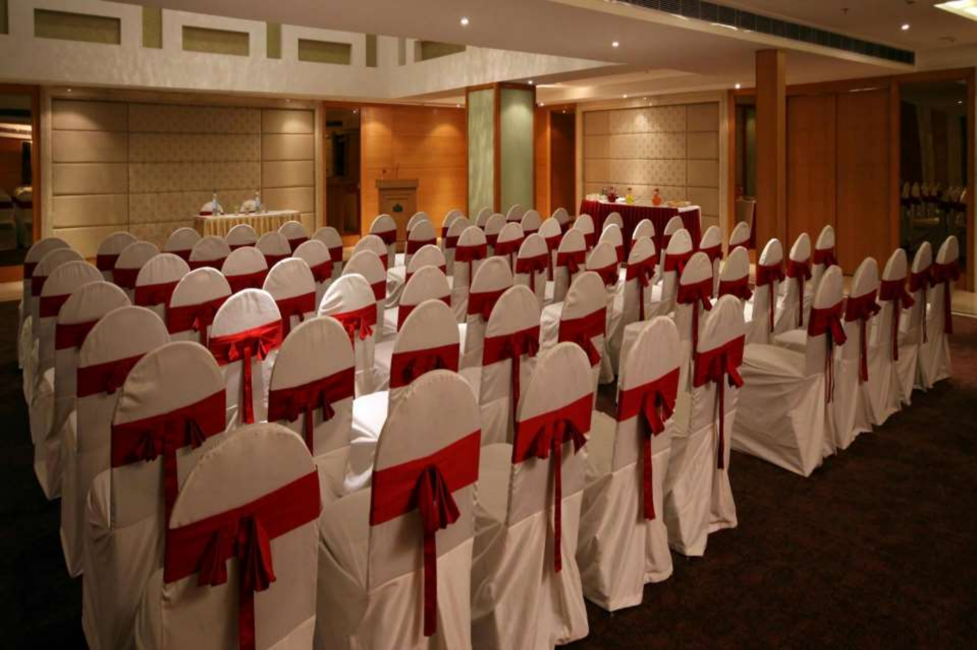
Fully Equipped Meeting Space