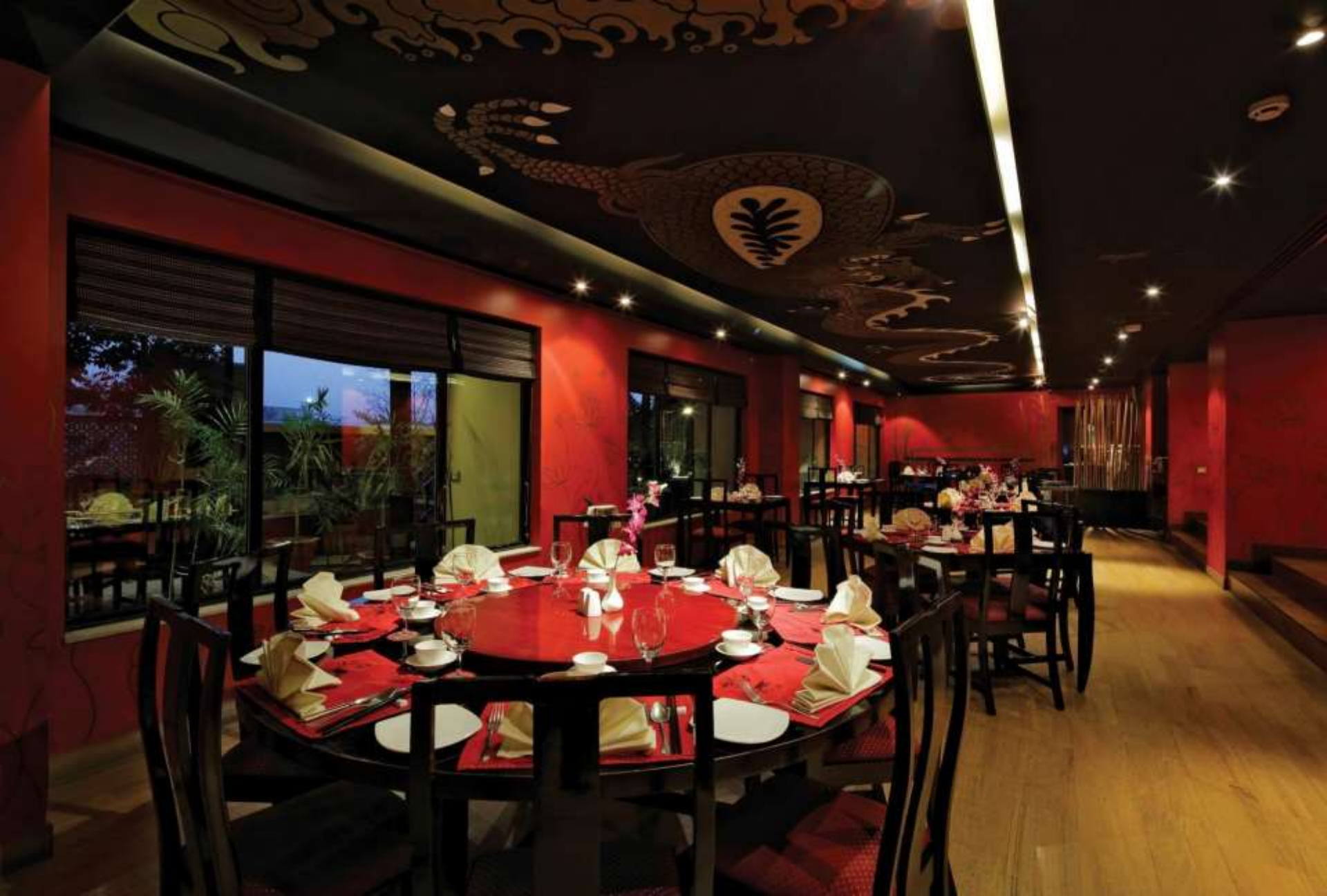
Dragon House- The Award Winning Chinese Restaurant