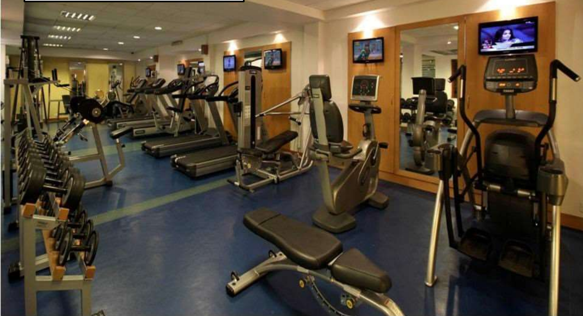
Revive- Gym & Spa

Timings: 06:30 Hrs to 21:30 Hrs Area: 1300 Sq Ft Free for In-house Guest