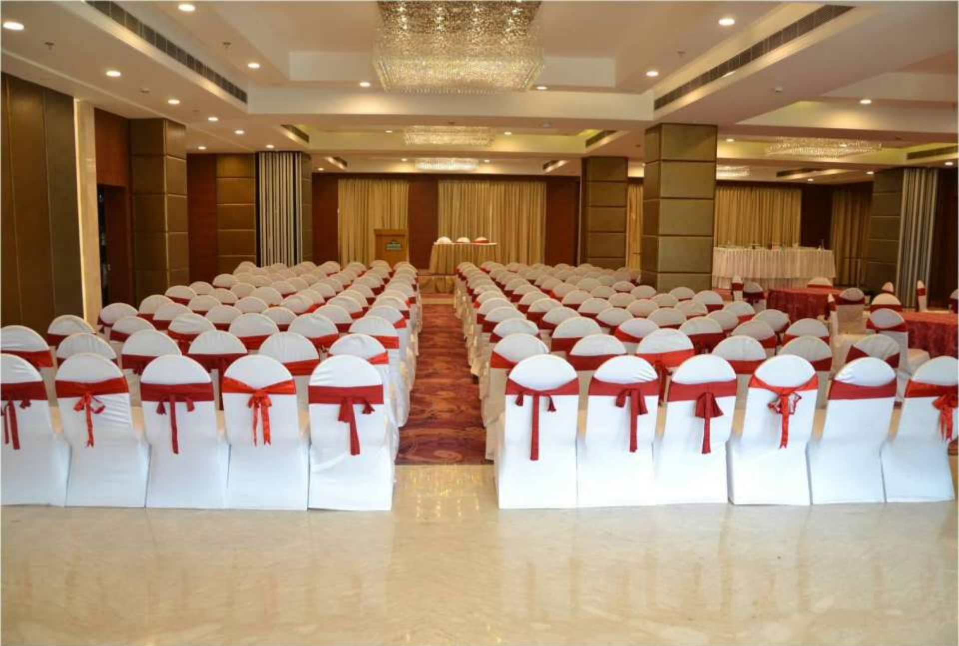
New Banquet Ball Room