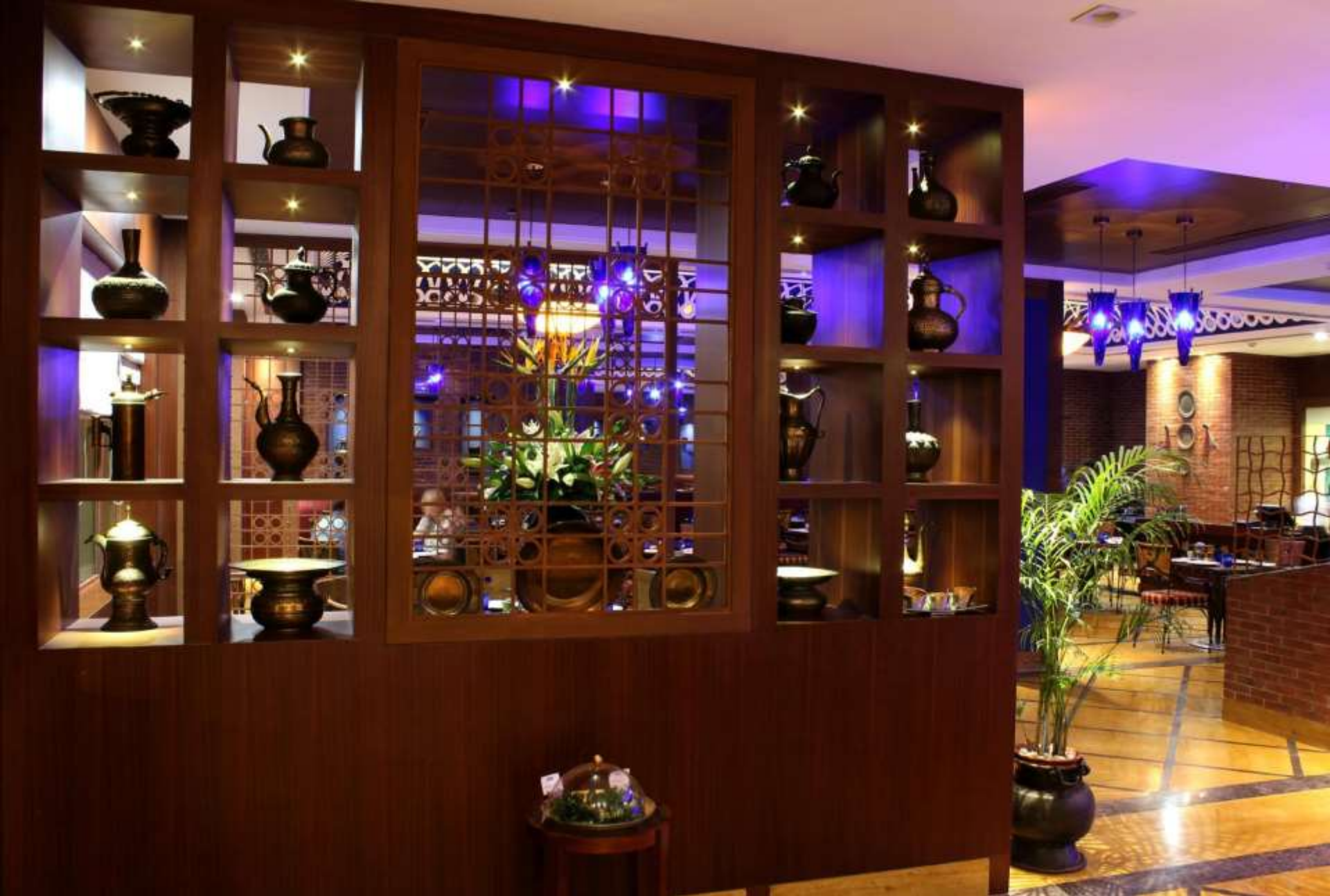
The Great Kabab Factory