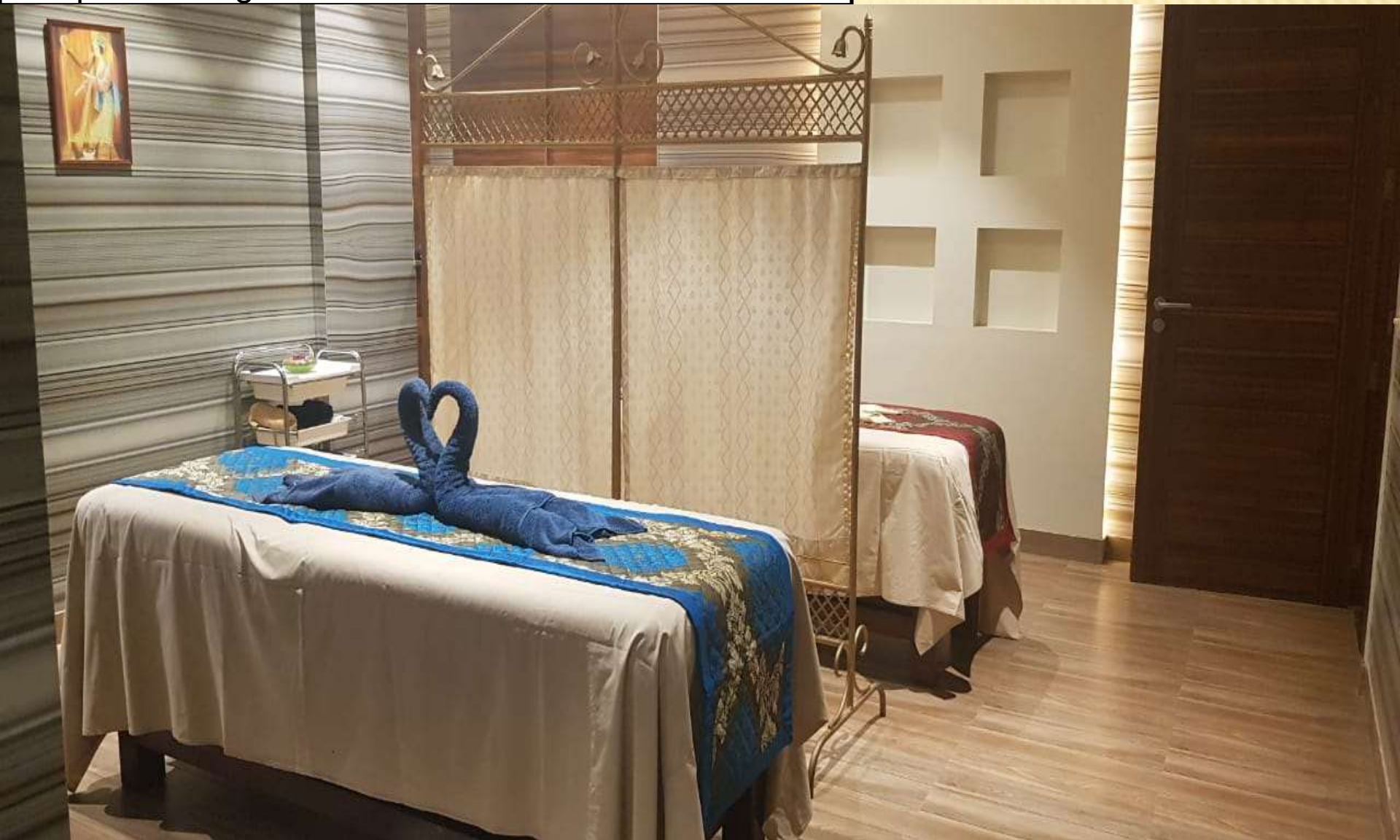
Revive Wellness Studio - Couple

Timings: 08:30 Hrs to 21:30 Hrs Steam, Sauna, Jacuzzi, Therapy: 03 Couple Massage Room: 01