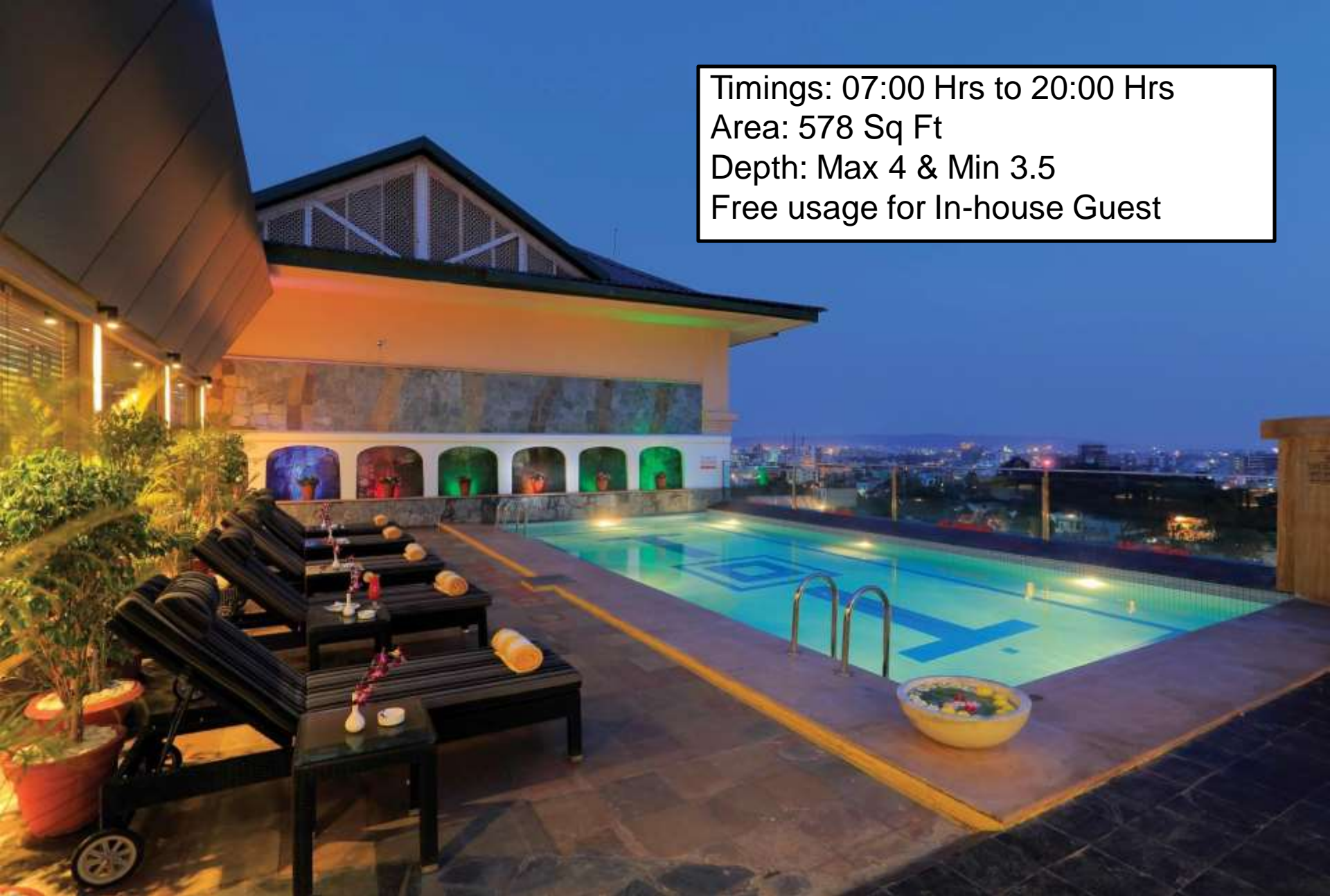
Roof Top Swimming Pool

Timings: 07:00 Hrs to 20:00 Hrs Area: 578 Sq Ft Depth: Max 4 & Min 3.5 Free usage for In-house Guest