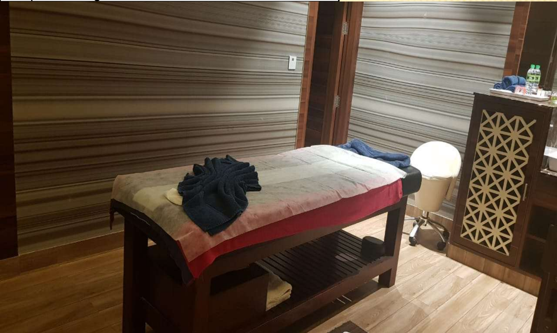
Revive Wellness Studio -Single

Timings: 08:30 Hrs to 21:30 Hrs Steam, Sauna, Jacuzzi, Therapy: 03 Couple Massage Room: 01