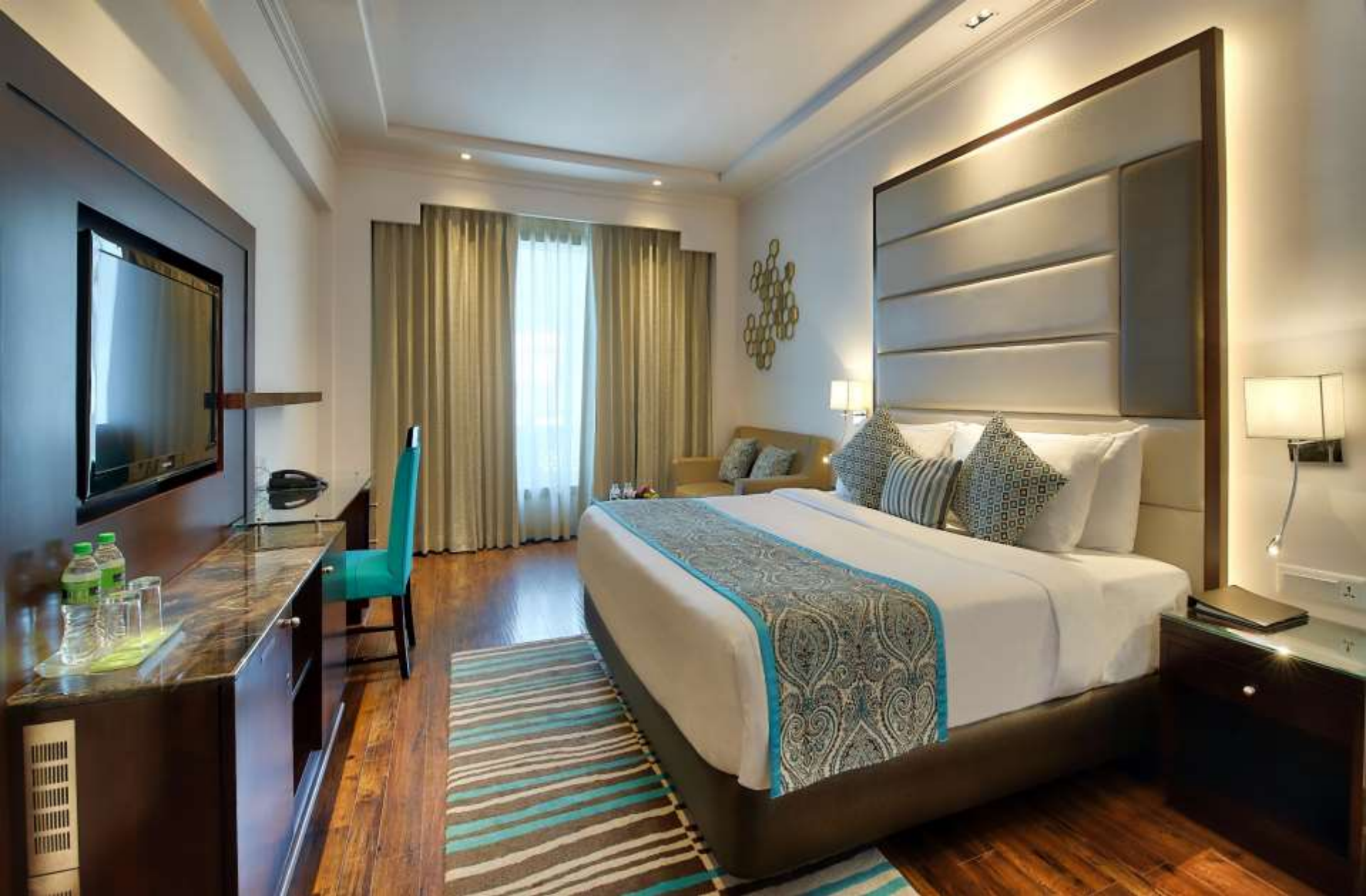
Business Class Room