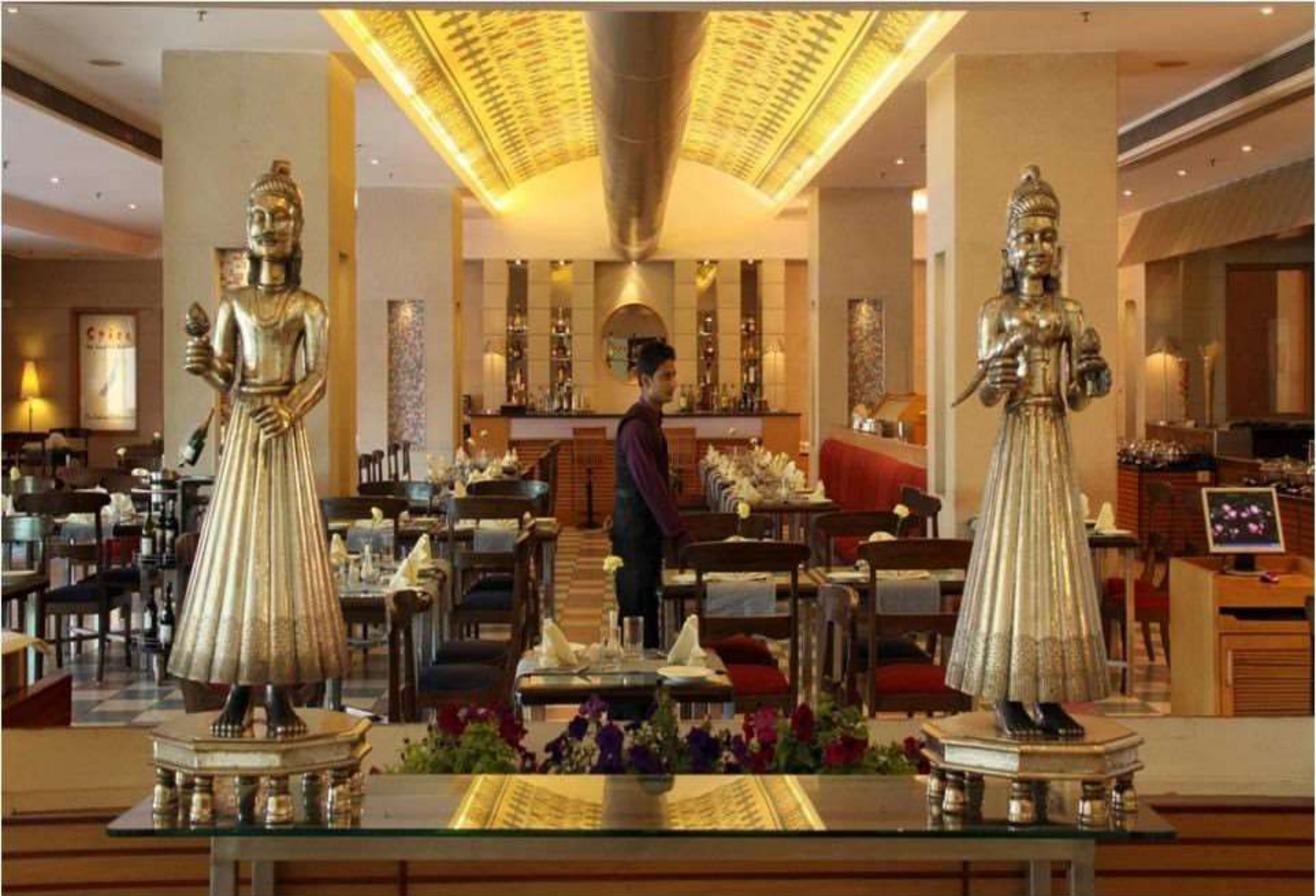
Mosaic- All Day Dining Multicuisine Restaurant