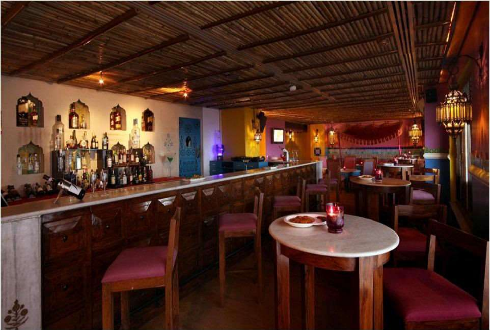
Kasbah- Moroccan Lounge