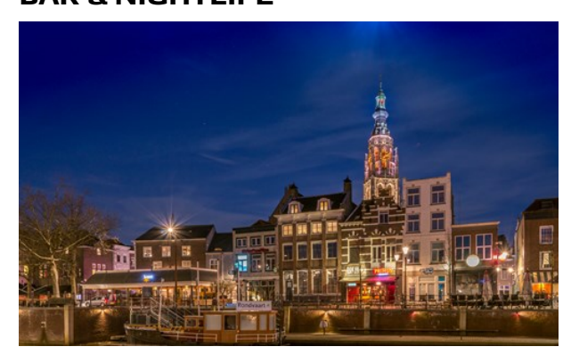
VisitBrabant

We know how to have a really good time. And we are happy to share our secrets with you. Experience Brabant's exuberant hospitality and nightlife.